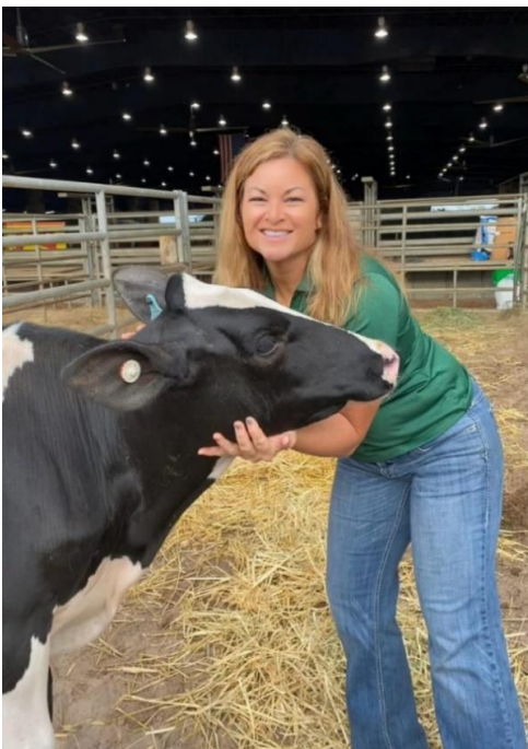
Fig. 1 - SLICK gene Holstein, University of Florida, Larson

SLICK genetically modified Holsteins incorporate a natural mutation that arose in Puerto Rico and other areas of the Caribbean Basin, but now it can be created using CRISPR. The US Food and Drug Administration (FDA) still approves commercial application of CRISPR modified animals on a case by case basis, investigating food safety for meat, milk, or other products produced. The “slick” hair coat phenotype is shown in Figures 1 - 3 below: