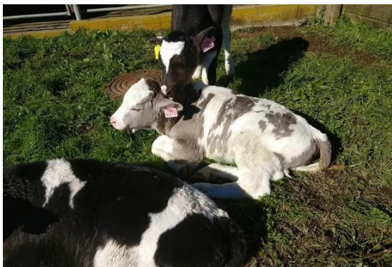
Fig. 3 - SLICK calves are sometimes grayer than “wild type” Holsteins

Evidence shows cattle health and milk production advantages of the “slick” hair coat in warm temperatures, and no problems with meat or milk safety according to the FDA “Risk Assessment Summary – V-006378 PRLR-SLICK cattle”. As is often the case with FDA documents, this one incorporates at least one element of mystery - I can find no date of when it was released. Nevertheless, it states, “ FDA did not identify any human food safety concerns associated with - - PRLR-SLICK cattle. In addition, there is a history of safe human consumption of food products derived from conventionally raised cattle with slick phenotypes.”