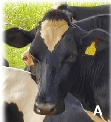
Fig. 2 - “Wild type” Holstein (A) Research Gate, Ortiz-Colon