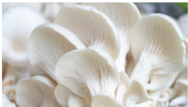
Figure 3. Oyster Mushrooms

These are the same mushroom but at different stages of maturity—white button being the youngest and portobello the most mature (Figure 2). They contain numerous antioxidant compounds with potential cancer-fighting, immune-boosting properties, as well as compounds that aid in promoting cardiovascular and gut health.