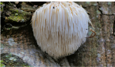
Figure 6. Lion's Mane Mushrooms

Pioppino mushrooms (Figure 5) are more traditional-looking mushrooms containing compounds with antioxidant, antiaging, and organ-protecting effects, as well as anti-inflammatory and anti-tumor properties.