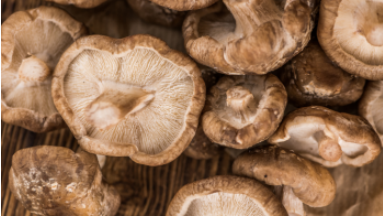
Figure 4. Shiitake Mushrooms