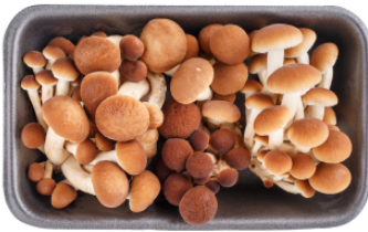
Figure 5. Pioppino Mushrooms

Shiitake mushrooms (Figure 4) are rich in compounds that protect against cell damage, boost the immune system, and have anti-inflammatory properties.