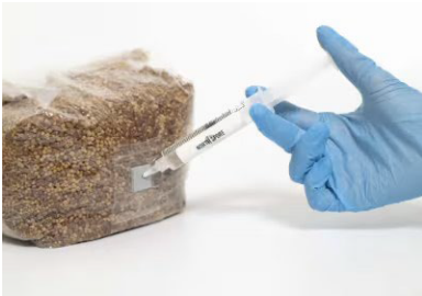
Figure 7. Injecting a Spawn Bag Containing Hydrated and Sterilized Grain With Fungal