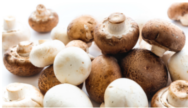
Figure 2. Cremini and White Button Mushrooms

To begin your mushroom-growing journey, we recommend the following five mushroom species that are easy to grow and yield mushrooms relatively quickly.