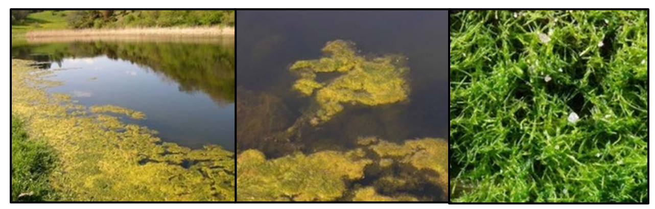
Examples of Cladophora green algae blooms.

Not all algal blooms or surface scums are cyanobacteria. Some green algae like Cladophora and Spirogyra can also create large blooms, but they do not produce harmful algal toxins. Green algae come in many forms and may look like underwater moss, thick stringy mats or floating slimy scum. Duckweed are tiny aquatic plants with a grainy or couscous-like texture. They may resemble miniature lily pads and are generally beneficial to the environment.