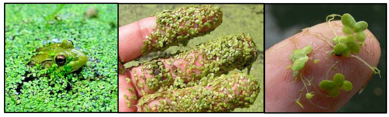
Examples of the aquatic plant duckweed.

Green algae / duckweed