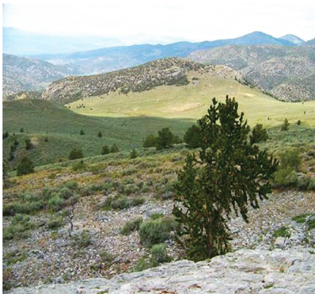
The Great Basin.

The western half of the state is part of the Great Basin, with no outlet to the sea. Most of the water in Utah's portion of the Great Basin flows to the Great Salt Lake. Water evaporates, leaving salts that accumulate over time. The salinity results in unique life forms and mineral deposits. The Bear River is the largest river in the Great Basin with an estimated natural flow of almost 1.2 million acre-feet per year 1 (1 acre foot is the equivalent of water used by a family of 3-4 in one year). The Great Salt Lake also receives water from the Weber and Jordan Rivers as well as smaller tributaries. Enroute to the Great Salt Lake, water for human uses is stored in Utah Lake, Bear Lake, Willard Bay Reservoir, Deer Creek Reservoir, Jordanelle Reservoir, Flaming Gorge Reservoir, and many smaller reservoirs. Not all water in the Great Basin flows to the Great Salt Lake. One example is the Sevier River, which transports water to Yuba Lake and terminates in Sevier Lake.