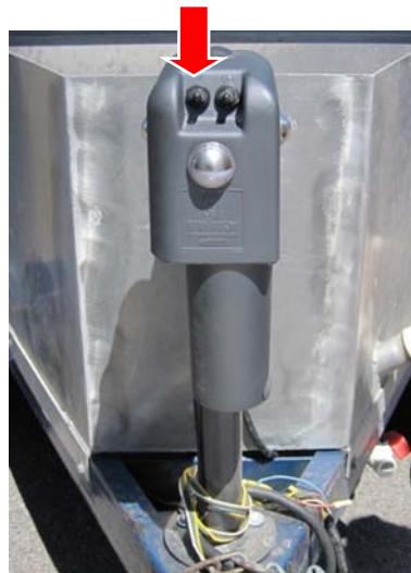
Electric Jack with left switch indicated