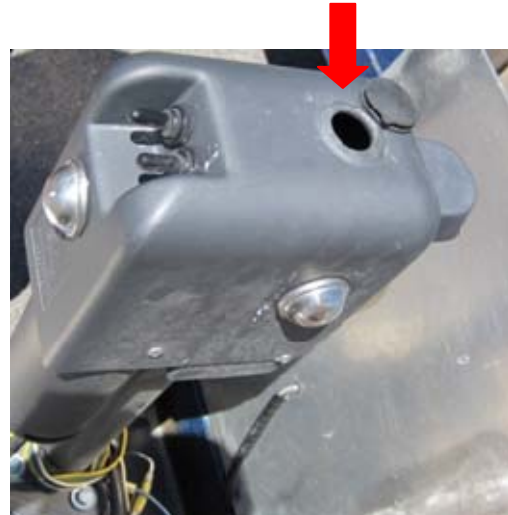
Electric Jack with hand crank hold indicated