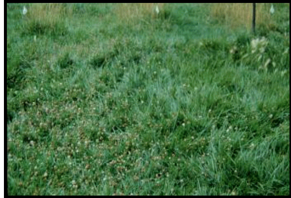
A mixed tall fescue-clover stand. Managing the stand with nitrogen or phosphorus can shift the balance to favor either the grass or legume.

but is frequently found on sandy soils, fields irrigated with clean waters low in potassium, and high elevation sites. Limited research has shown that grass and grass-legume mixtures respond to potassium when soils are deficient. Fertilizer should not be applied unless a soil test indicates a need since fertilizing high potassium soils will produce undesirably high potassium levels in the forage. Potassium recommendations based on current soil test results are summarized in Table 4.