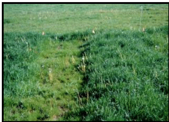
Perennial ryegrass response to nitrogen (photo taken in May). The plot on the left received no nitrogen, the plot on the right received 50 lb N/acre in April.