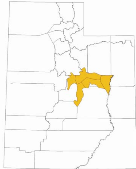
Figure. 3. The Castle Country Adaptive Resource Management (CaCoARM Sage-grouse Local Working Group Conservation Area consists of 1,906,443 acres located in eastern Utah.

The information below summarizes efforts made by individual and partners to address threats and strategic actions for the Castle Country Greater Sage-grouse Local Conservation Plan October 2006. This adaptive plan is in effect until the year 2016. CaCoARM partners reported on specific actions completed or addressed in 2009-2010 and identified steps to be taken to implement additional actions into subsequent years of the plan. For the complete list of threats identified by the CaCoARM group, see page 64 of the conservation plan located on line at http://utahcbcp.org/files/uploads/carbon/CaCoARM_final-01-07.pdf