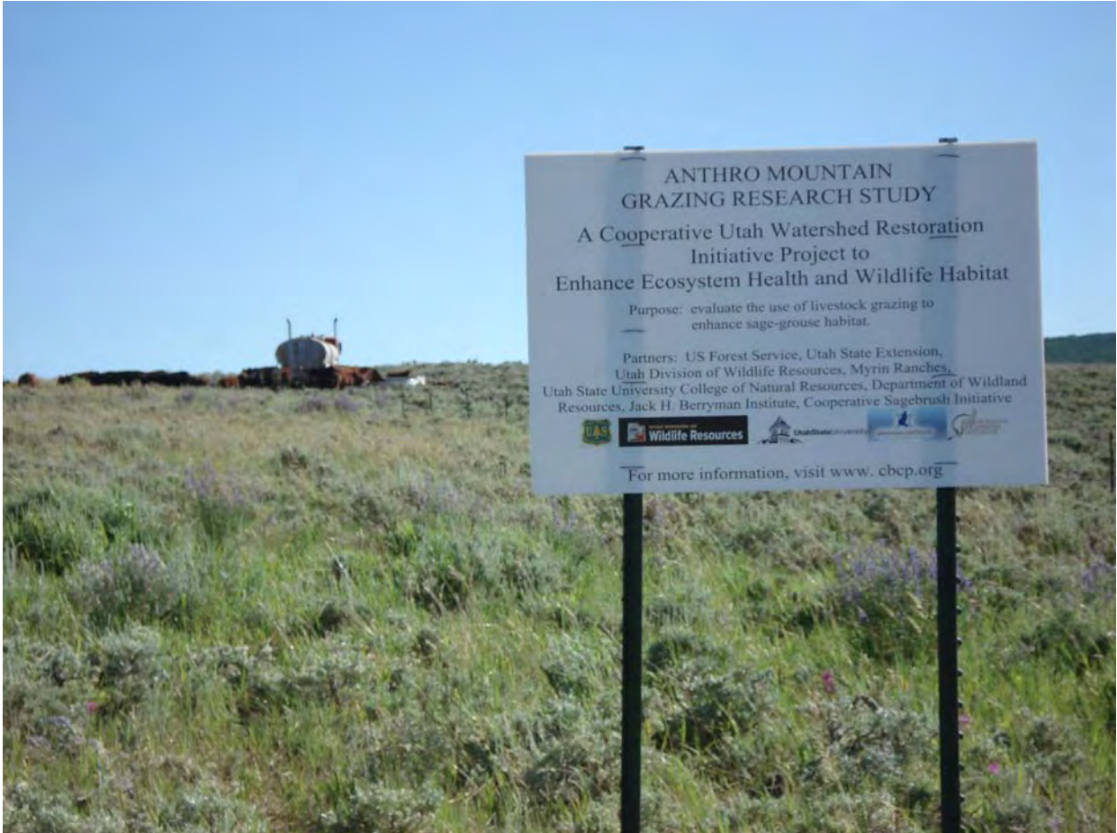
Anthro Mountain Grazing Research Study sign with cattle in pasture #7 gathered around the water troughs and tanker.