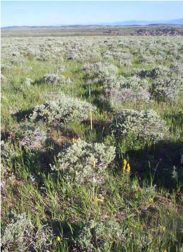
Figure 2. To establish a transect, a 100' tape is stretched from the baseline point. Endpoints are marked with permanently placed 8" steel spikes and flagging. Vegetation is measured at predetermined intervals along the transect for characteristics such as forb or shrub cover and species composition.

In late-June, 2009, we identified 4 paired-plot (1 paired-plot = 1 treatment plot and 1 control plot) locations on similar ecological sites. Each plot was approximately 10 acres. Individual plots were randomly assigned to the grazing treatments of graze, or control. Plot corner coordinates were downloaded into a GPS unit and marked with steel t-stakes. The 4 treatment plots were fenced with 2 strands of portable electric polypropylene fencing. The electric fencing was charged using 12-volt deep cycle batteries. A baseline with 5 randomly located 30-m vegetation transects was established and marked in each treatment and control plot. Baseline endpoints were marked with metal t-stakes; transect endpoints were marked with 8" metal spikes driven to ground level, painted with fluorescent paint, and flagged (Figure 2). Grazing exclosures were also constructed around representative vegetation in each plot for productivity measurements.