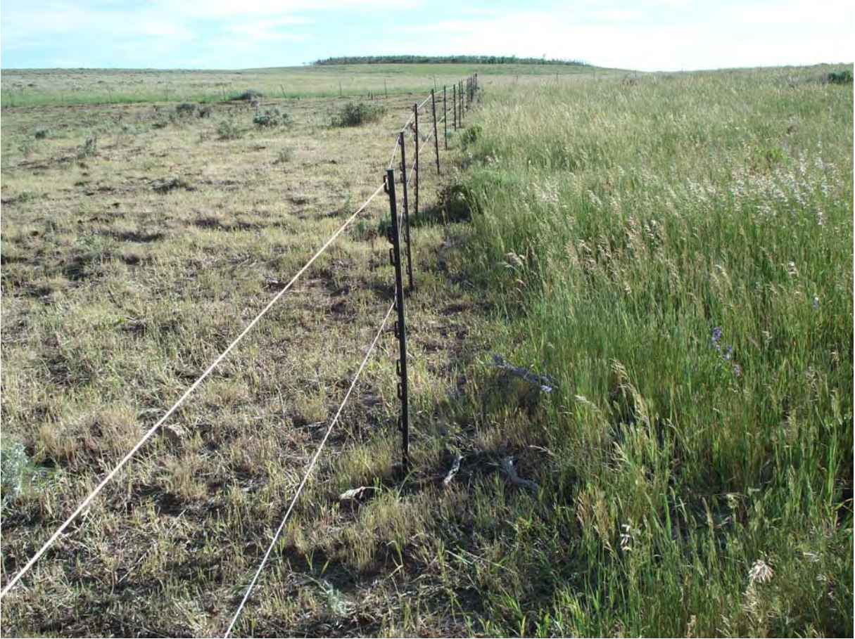
Fenceline showing forage conditions after 18 hours of grazing in pasture #3 on the left of the fence, and immediately prior to grazing in pasture #6 on the right of the fence.