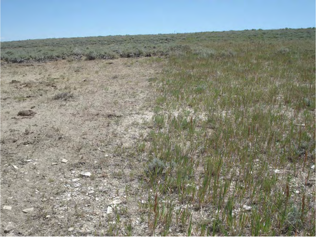
Fenceline of pasture #7 showing pre- and post-grazing conditions.