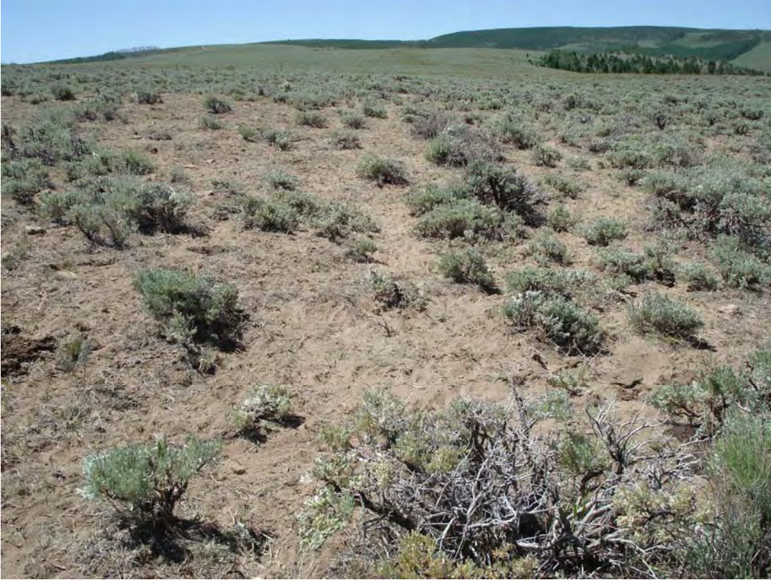
Utilization estimated at over 90%.