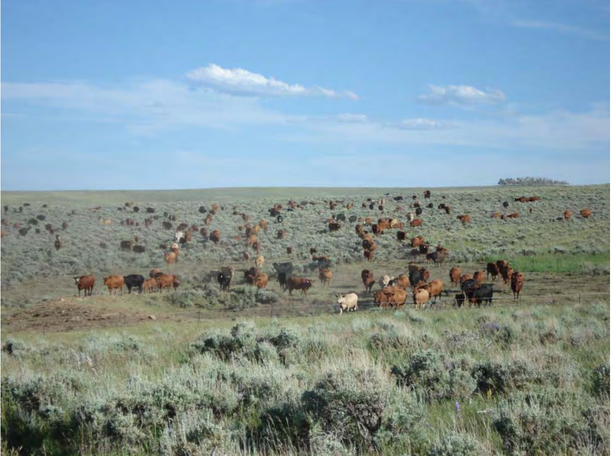
169 cow-calf pairs fill a 10 acre pasture.