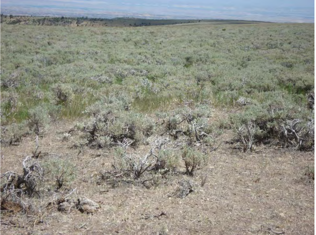
Fenceline after removal of fencing in pasture #2.