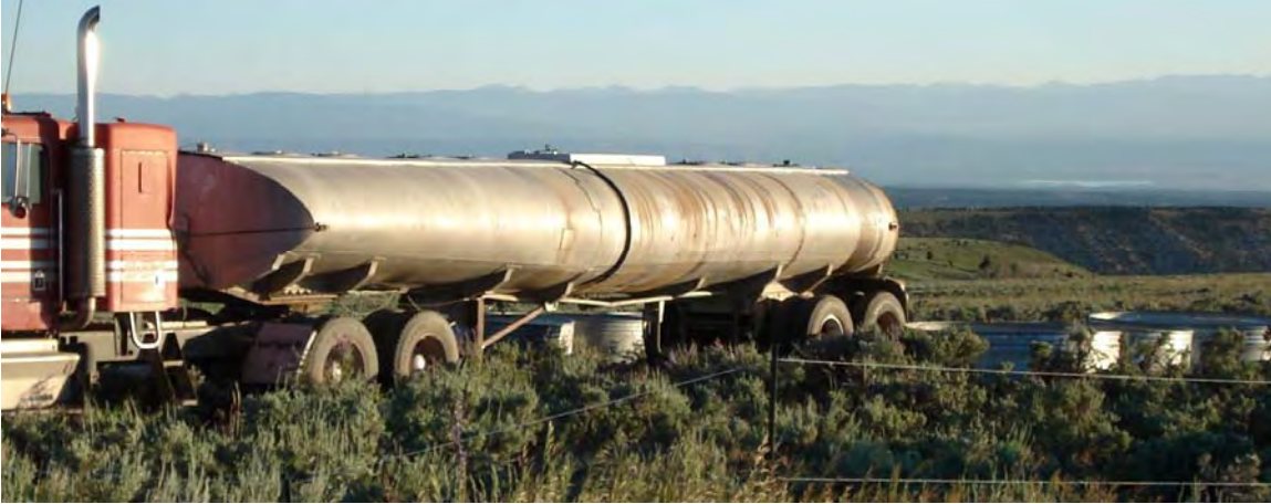
Figure 3. The herd required over 5070 gallons of water each day. A private contractor trucked water to the study site and left the full tanker onsite. Six steel troughs were filled 5-6 times each day to maintain free access to water for all cattle.

Two days prior to initiation of the grazing treatment, we measured all transects for species composition, foliar cover with the point intercept method (every 20 cm), shrub cover with line-intercept, and forb-grass cover with Daubenmire frames every 3 m (Figure 4, Daubenmire 1959). Productivity and utilization were estimated from clipping and weighing all forbs and grasses within the Daubenmire frame at 2, 8, 14, 20, and 26 meters.