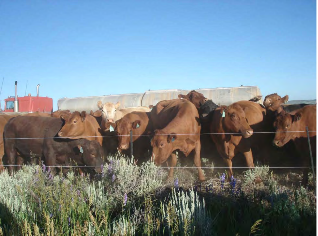
Cattle waiting for the gate to be taken completely down.