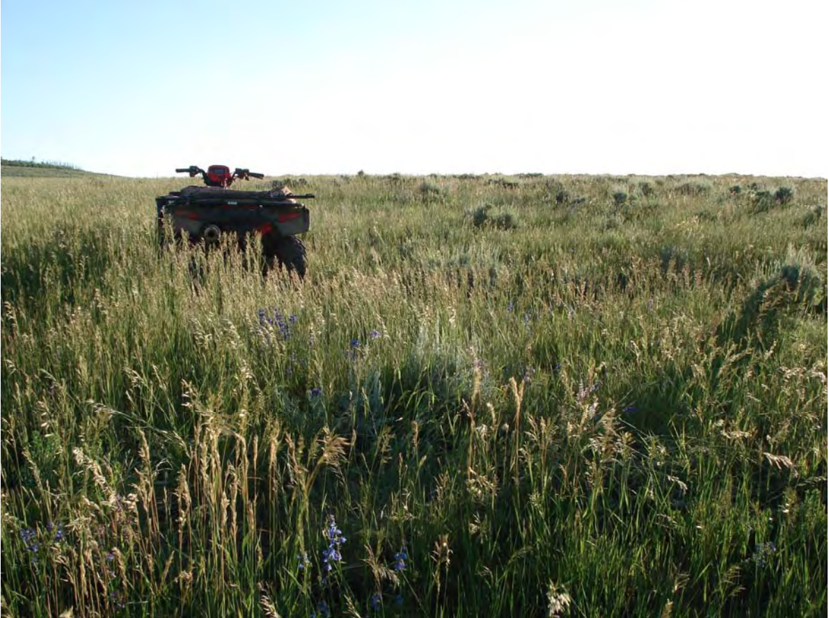
Pre-treatment forage in pasture #6.