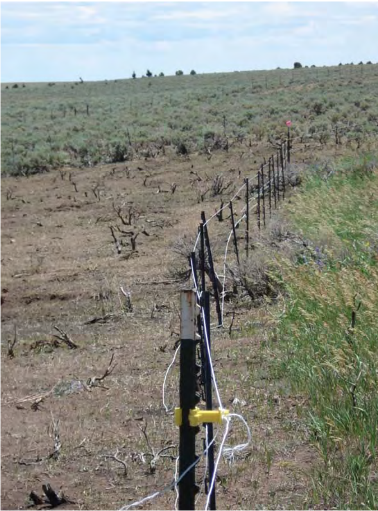
Electric fencing works, but it doesn't stop 'reaching under'.