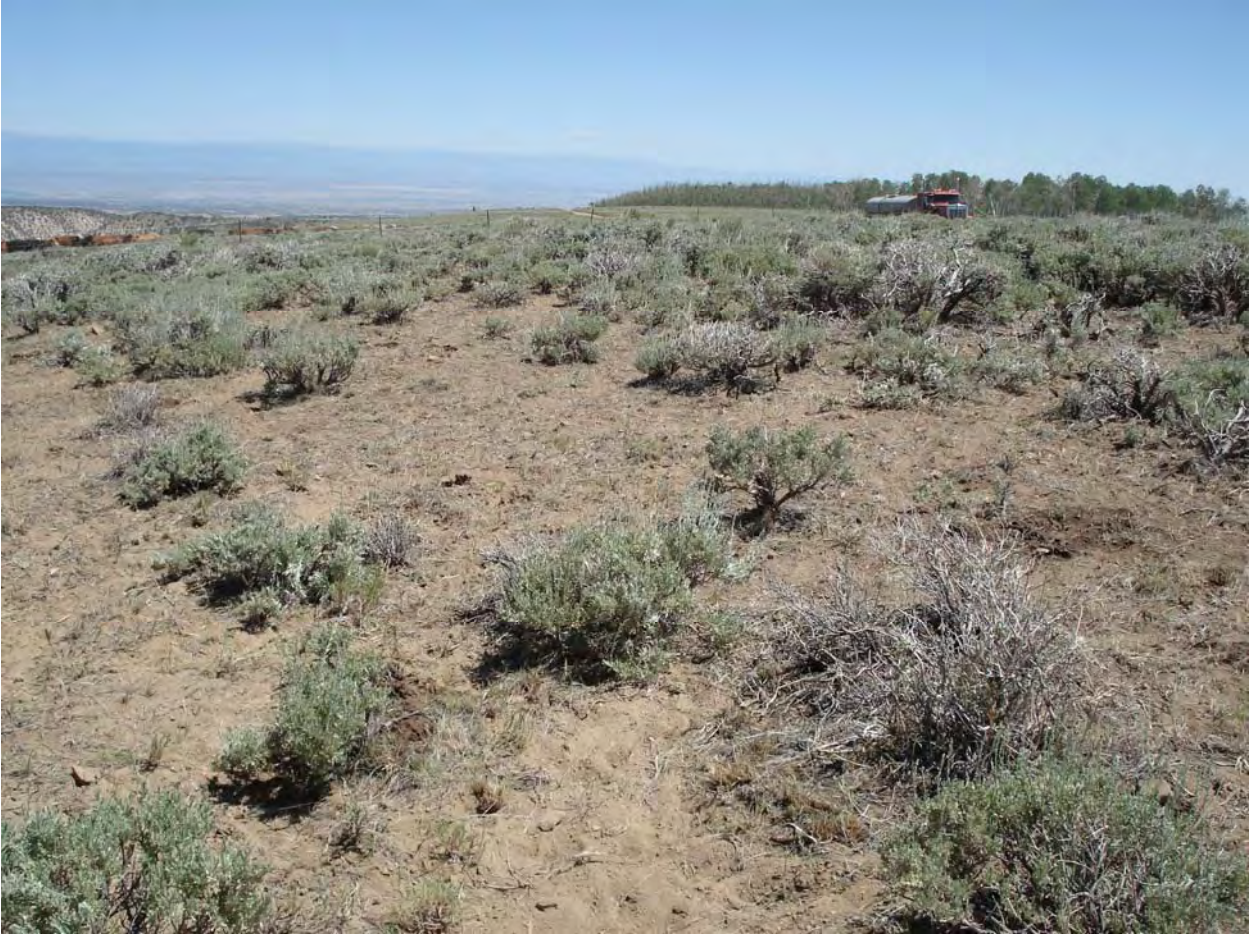
Utilization estimated at over 90%.