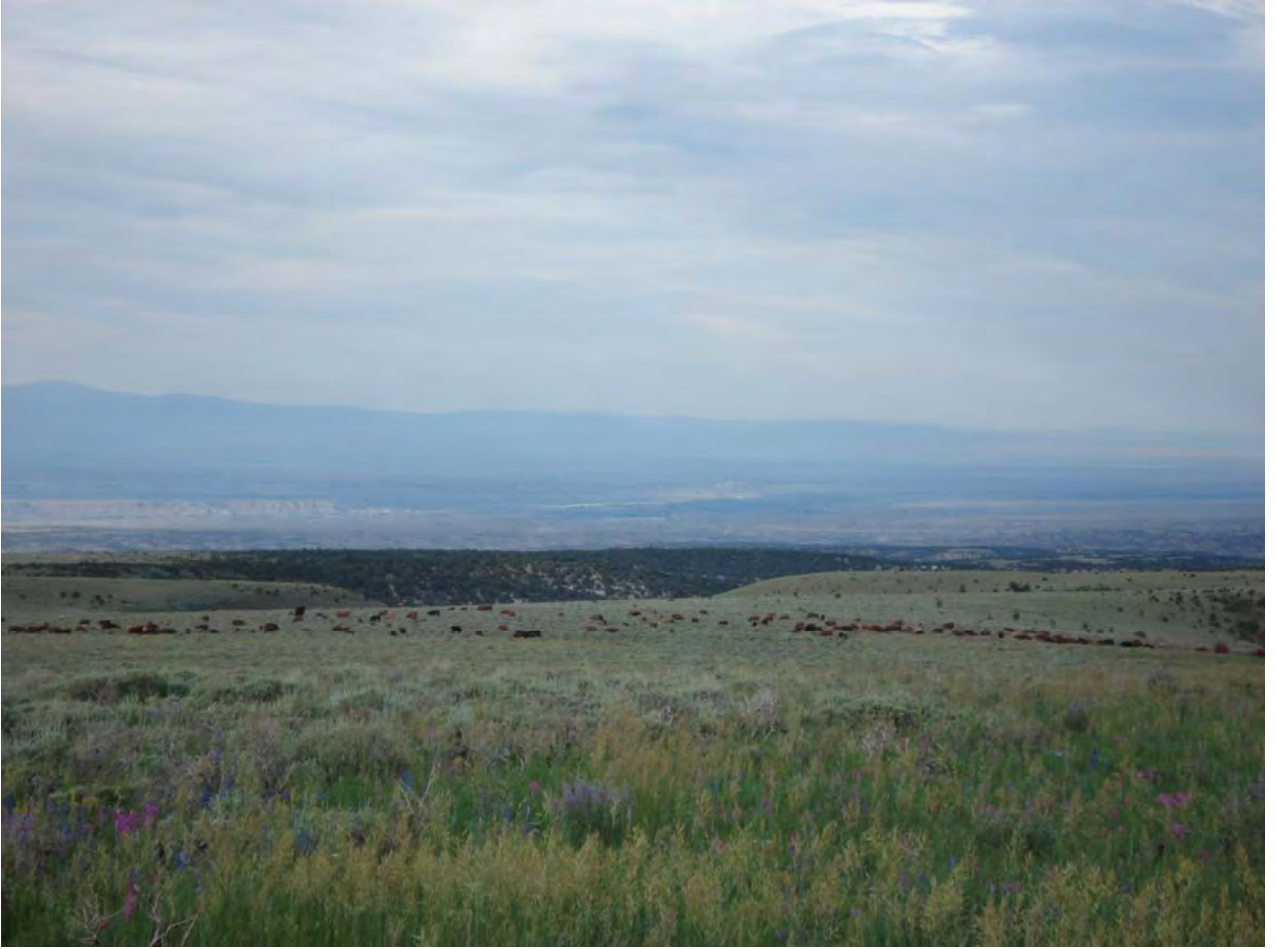
Anthro Mountain view of the Uinta Basin, and of 169 cow-calf pairs on 10 acres.