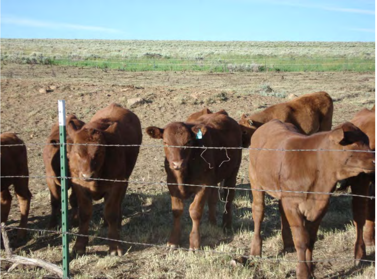
Contemplating life (on the other side of the fence). Notice the green vegetation on the other side of the fence in the background.