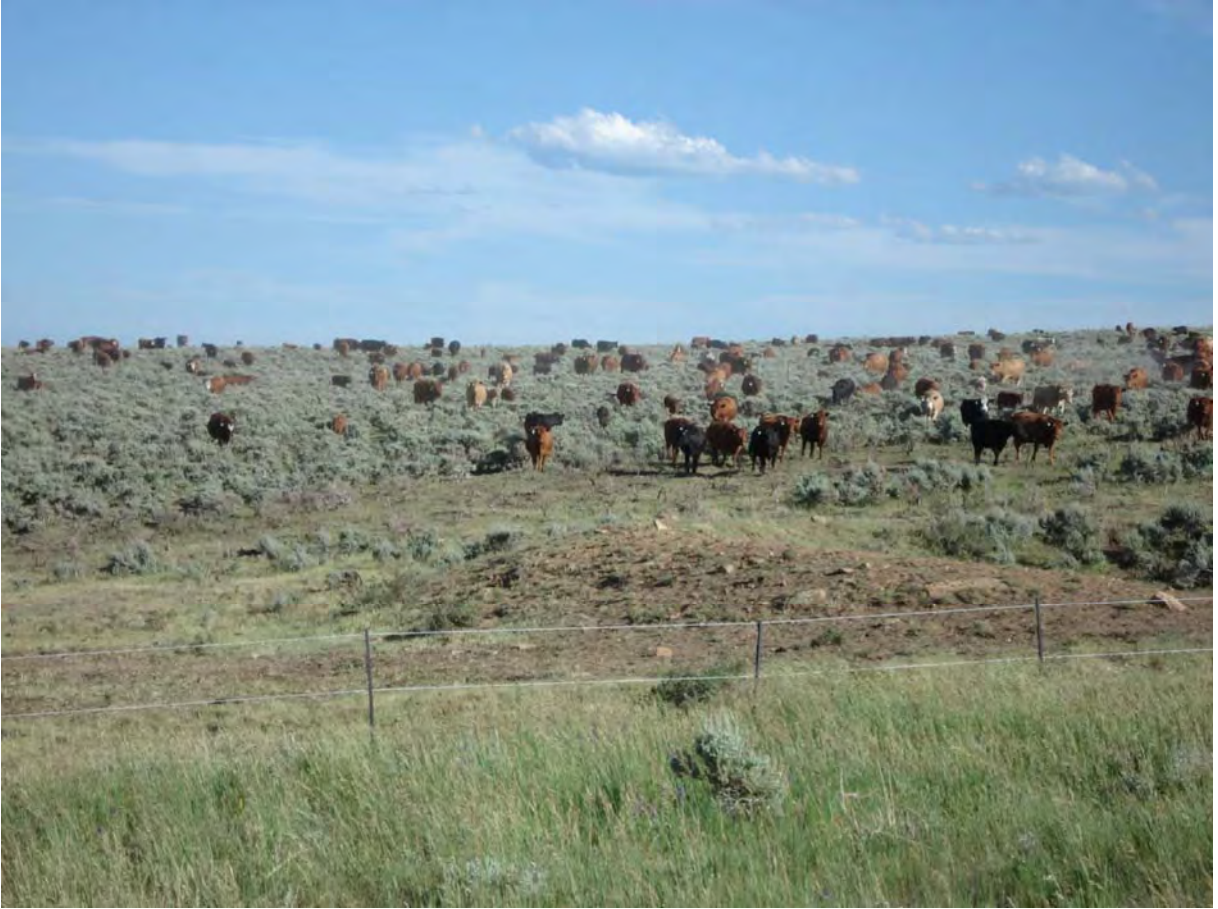
At 18 hours of grazing in pasture #3 cattle are seriously considering the grass on the other side of the fence.