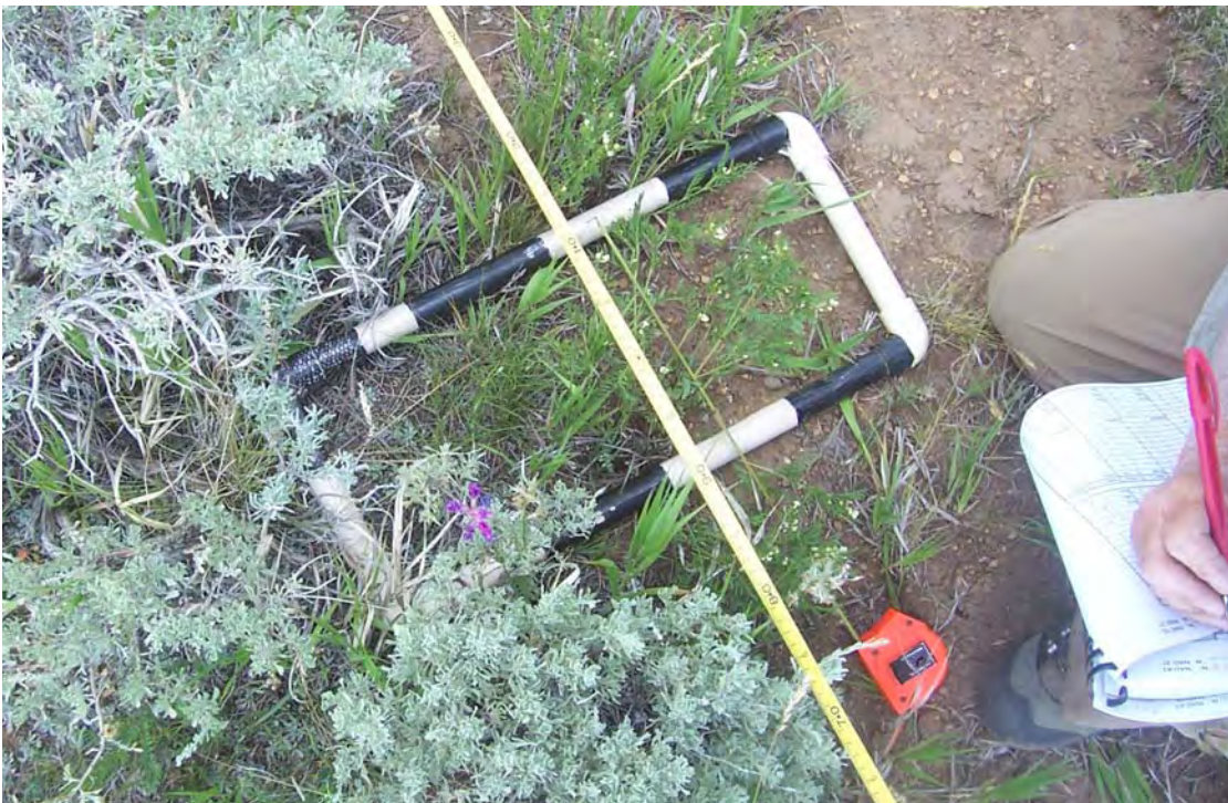
Figure 4. Daubenmire frames provide units of reference for estimating the percentage of cover within the frame area provided by each species of grass and forb, as well as of bare ground, litter, and rock.

Two days prior to initiation of the grazing treatment, we measured all transects for species composition, foliar cover with the point intercept method (every 20 cm), shrub cover with line-intercept, and forb-grass cover with Daubenmire frames every 3 m (Figure 4, Daubenmire 1959). Productivity and utilization were estimated from clipping and weighing all forbs and grasses within the Daubenmire frame at 2, 8, 14, 20, and 26 meters.