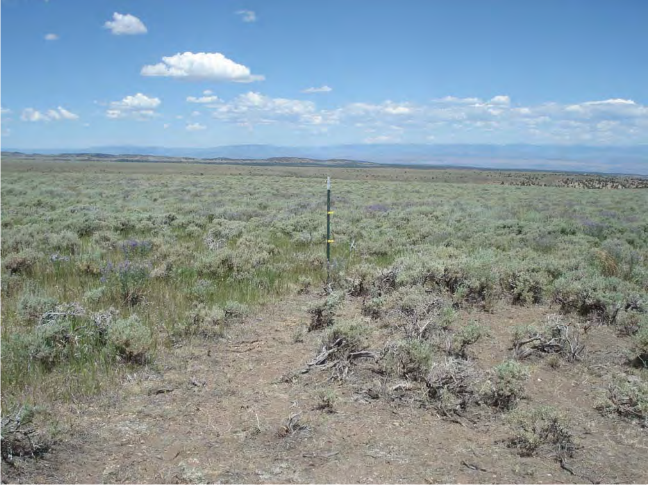
Corner post of pasture #7 after grazing and removal of fencing.