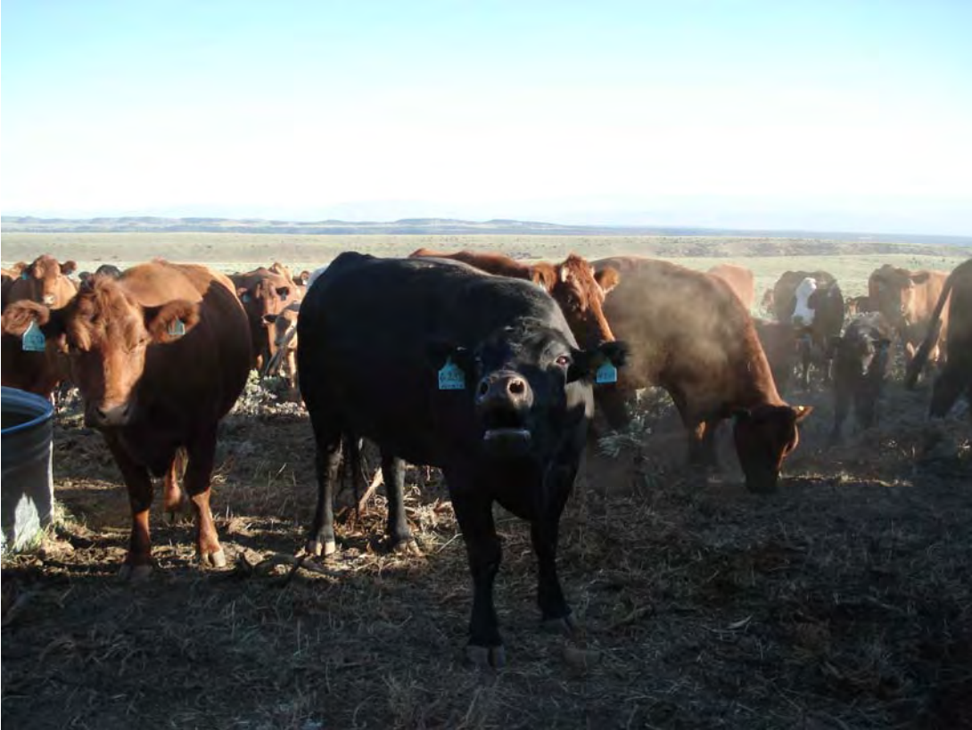
Cows agree to move to pasture #2.