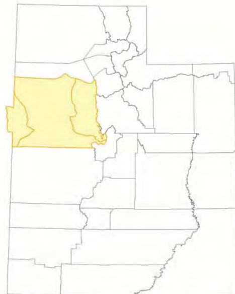
Figure 11. The West Desert Adaptive Resource Management (WDARM) Sage-grouse Local Working Group Conservation Area consists of 5,137,991 acres located in western Utah.

This is particularly important in an area where substantial fire and fuel management projects intersect sage-grouse habitat. WDARM members have increased the depth of coordination between multiple entities as well: based on information provided to the group by a private landowner in attendance at the group meeting, a plan to address weed concerns near one of the leks was developed with shared leadership and resources from BLM, Tooele County Commission, weed managers from NRCS, and DWR. WDARM also stepped up its efforts to better understand the social and ecological complexity of recreation impacts to sage-grouse habitat. This will be a focus in the coming year.