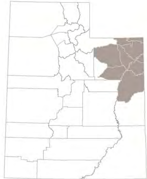
Figure 10. The Uintah Basin Adaptive Resource Management (UBARM) Sage-grouse Local Working Group Conservation Area consists of 5,375,423 acres located in eastern Utah.