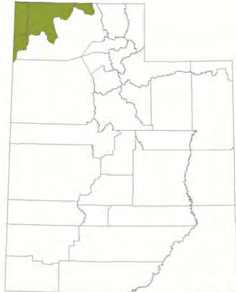
Figure 2. The Box Elder Adaptive Resource Management (BARM) Sage-grouse Local Working Group Conservation Area consists of 1,702,251 acres located in northwestern Utah.

2. Strategy: By 2011 make an assessment of cheat grass and other non-desirable species in sage-grouse habitats.