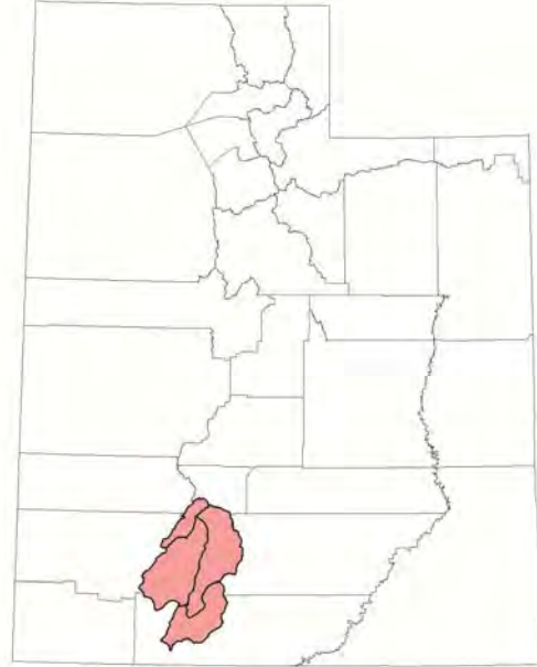
Figure 4. The Color Country Adaptive Resource Management (CoCARM) Sage-grouse Local Working Group Conservation Area consists of 4,956,258 acres located in south-central Utah.

1.3 Action: Determine brood-rearing success in each focus area annually.