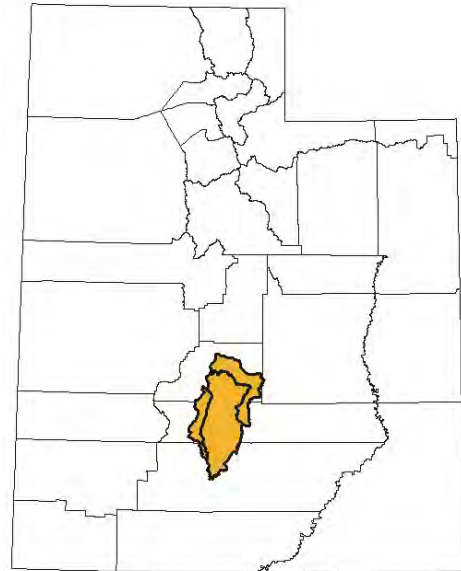
Figure 6. The Parker Mountain Adaptive Resource Management (PARM) Sage-grouse Local Working Group Conservation Area consists of 1,789,644 acres located in south-central Utah.