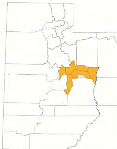
Figure. 3. The Castle Country Adaptive Resource Management (CaCoARM) Sage-grouse Local Working Group Conservation Area consists of 1,906,443 acres located in eastern Utah.

http://utahcbcp.org/files/uploads/carbon/CaCoARM_final-01-07.pdf