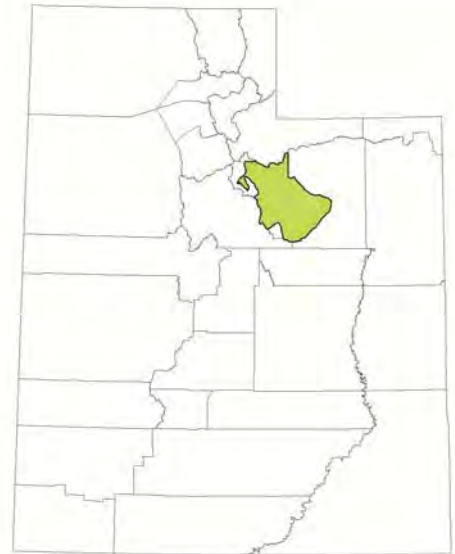
Figure 9. The Strawberry Valley Adaptive Resource Management (SVARM) Sage-grouse Local Working Group Conservation Area consists of 948,568 acres located in north-eastern Utah.

SVARM members combine active habitat improvement projects with valuable research efforts in order to understand both population trends as well as sage-grouse use of habitat project sites. These sites are effective demonstration projects and valuable beyond the region as education tools as well as having direct benefits for local sage-grouse populations. Two sites in the area have been treated over the last several years to improve brood-rearing habitat (Trout Creek and Chicken Springs), and another is in the planning stages. Researchers with Brigham Young University (BYU) are tracking grouse use of the treatment areas in addition to many other research questions. These BYU researchers are also investigating population dynamics, impact of predation on sage-grouse populations, genetic variation in the population, and many other topics. The working group receives regular updates from the research team. Members of the SVARM group have excellent, open lines of communication, often coordinating state, federal, local, and private efforts in project planning, implementation, and follow-up efforts. Weed control efforts are an excellent example of this kind of focused collaborative effort: Wasatch County, USFS, UDWR, and private individuals all work together to address weed issues for sage-grouse.