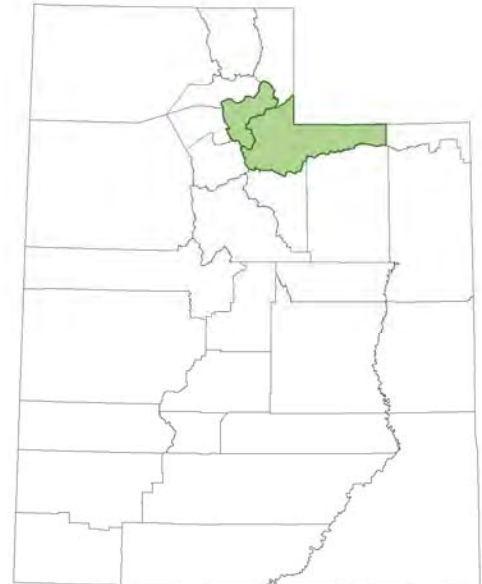
Figure 5. The Morgan-Summit Adaptive Resource Management (MSARM) Sage-grouse Local Working Group Conservation Area consists of 1,608,659 acres located in northern Utah.

The MSARM group has expanded discussions about weed management for sage-grouse, including discussions with a Morgan County commissioner regarding weed management's importance for sage-grouse. In addition, concerns over bulbous bluegrass conversions in sagebrush habitats generated some general project ideas that will hopefully result in WRI project proposals next year. UDWR continues to treat weeds on the two local Wildlife Management Areas (Henefer Echo and East Canyon) as needed. NRCS does many weed control projects with local landowners, although none were targeted specifically at sage-grouse habitat.