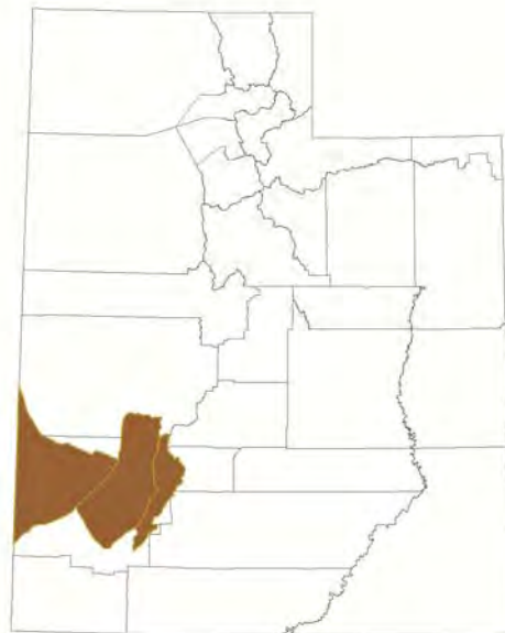
Figure 8. The Southwest Desert Adaptive Resource Management (SWARM) Sage-grouse Local Working Group Conservation Area consists of 5,672,052 acres located in south-western Utah.

One of the main purposes of the SWARM Plan is to provide a framework of strategies and associated actions that can be implemented to abate threats identified by the USFWS (2010), address information gaps, and guide monitoring efforts. Strategies and actions listed below were developed by SWARM partners. For example, we have initiated two new research projects in the SWARM area as a direct result of partnerships among the agencies to target threats and data gaps for this region. The information gathered from these research projects will be used to drive future management actions in this region. These projects are partnerships with many organizations including SFH, UDWR, NRCS, and BLM that provide both monetary support (>$208,000 combined) and in-kind services. Additionally, local landowners are involved in assisting with research in Hamlin Valley.