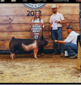
Reserve Champion Hog Aspen Hall Buyer: Hall Farms &Show Pigs, Pacific West, Tooele Valley Plumbing