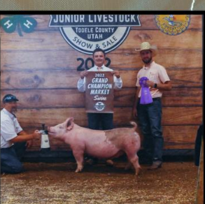
Grand Champion Hog Kimber Hall Buyer: Hall Farms &Show Pigs, Grantsville FFA, Ames Construction