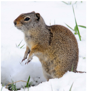
Uinta Ground Squirrel