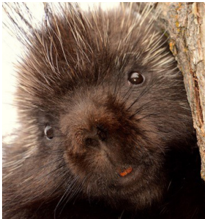
North American Porcupine