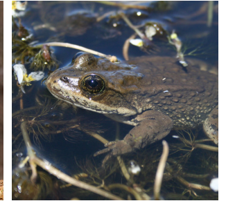
Columbia Spotted Frog