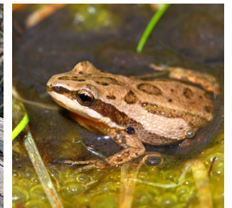
Western Chorus Frog

*Denotes a non-native introduced species