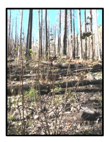
Browsed aspen suckers soon after wildfire in northern Arizona

Regardless of disturbance aspen or type, maintaining aspen resilience is highly dependent on local levels of ungulate herbivory (Seager et al. 2013). In the West, prominent aspen browsers include cattle, sheep, elk, and deer. If great care is not taken to protect postdisturbance and posttreatment stands from