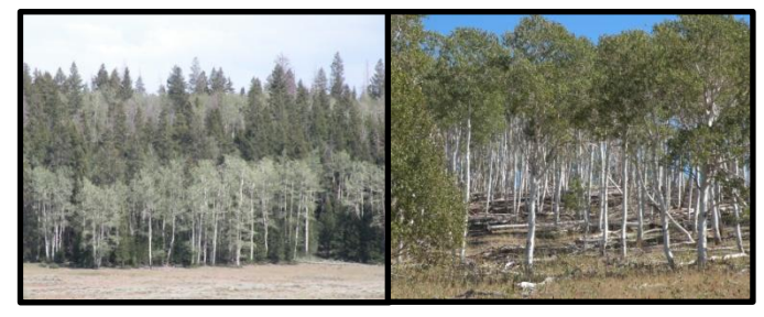
Montane seral (L) and Colorado Plateau stable (R) aspen

use. The elevated level of forest and rangeland burning during this period resulted in many of the mature aspen forests we see today (Kaye 2011).