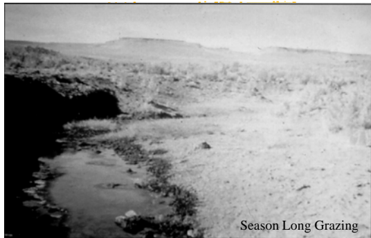
Goosey Lake Flat (NV), 1965