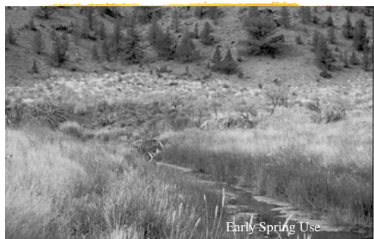
Bear Creek (OR), 1996