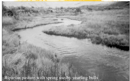
Riparian pasture with spring use by yearling bulls