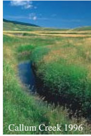
Callum Creek 1996