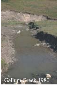
Callum Creek 1980