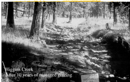
Some situation are difficult