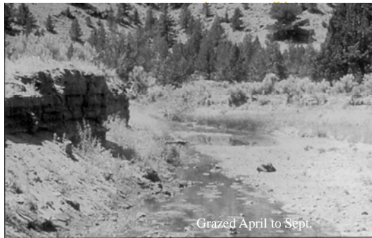
Bear Creek (OR), 1976