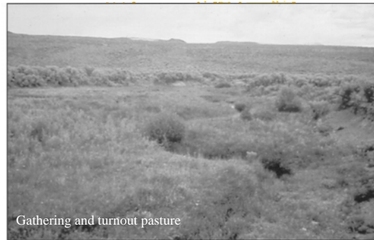
Goosey Lake Flat (NV), 1991