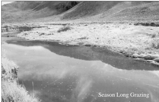
Season Long Grazing