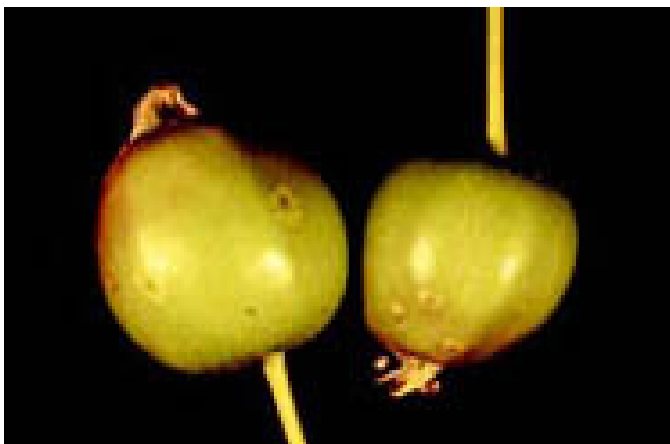
Thrips lay eggs into apple fruitlets causing injury.