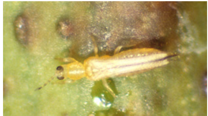
Western flower thrips adult; note the fringed wings are folded over its back.