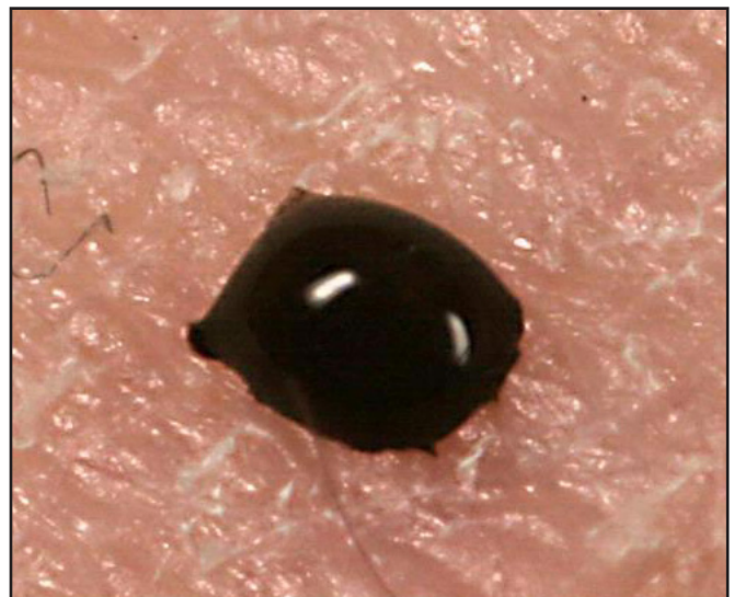
Fig. 6. Bed bug fecal spot. 1

Bed bugs prefer to feed on exposed bare skin (face, neck, shoulders, arms, hands, etc.). If left undisturbed, a bed bug can obtain a full blood meal in 3 to 5 minutes, but averages about 15 minutes. After feeding they will quickly retreat into hiding. They are sensitive to movement, and will withdraw their mouthparts if disrupted,