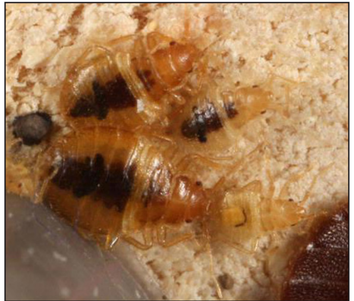
Fig. 5. Immature and adult bed bugs often huddle together. 1

Bed bugs are secretive, nocturnal insects that emerge from hiding places at night to feed on nearby hosts. Although bed bugs are wingless, they can travel over 4 feet per minute, and travel an average of 20 feet in search of food. In extreme cases, bed bugs have been