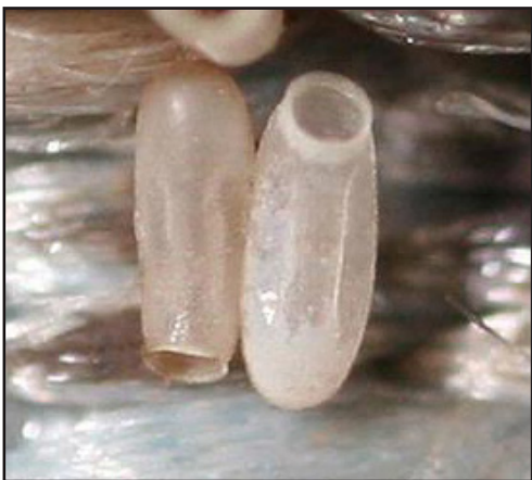
Fig. 4. Bed bug ( C. lectularius ) eggs (~ 1mm long) 1 .

Bed bugs reproduce via "traumatic insemination." Unlike traditional fertilization, male bed bugs will pierce the females body cavity with its copulatory organ and deposit sperm into the body cavity. Females have a specialized organ (mesospermalege) under their hard outer shell that accepts sperm and translocates it to the ovaries. Mated females begin laying eggs 3 to 6 days after fertilization, and can lay 200-500 eggs over a life span of 6 to 18 months. On average, bed bugs lay 5 eggs per week. Eggs are oval-shaped and white, and are about 1mm long--visible to the unaided human eye (Fig. 4). Eggs take 7 to 10 days to hatch, and can be resistant to insecticide treatment. At the least, bed bug egg biology makes a second insecticide treatment necessary 2 weeks after the first. Because