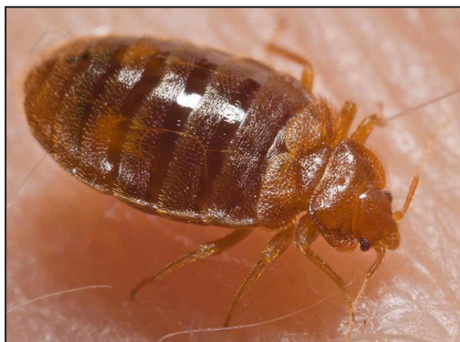
Fig. 1. Adult bed bug. 1

While some people believe that bed bugs switched from feeding on bats to "cavemen" over 12,000 ago, it