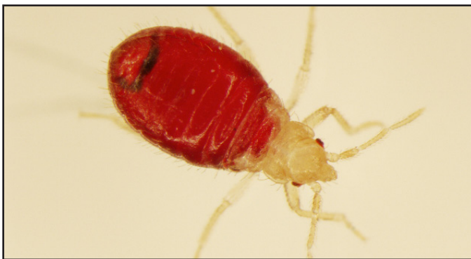
Fig. 2. Bed bug nymph engorged with blood. 2

Human bed bugs are oval insects that are flattened top to bottom, and are visible to the unaided human eye. Adults are always wingless and may resemble aphids, ticks, or other immature true bugs (Fig. 1). Bed bugs are normally brown in color, but become red and bloated after feeding (Fig. 2).