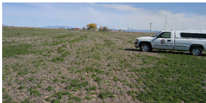
Fig. 1. A one-year stand of alfalfa heavily infested with alfalfa stem nematode. Less than 50% of plants remain due to die-out from the infected seedlings.

ASN is increasingly a concern to alfalfa producers in all regions of Utah; however, noticeable losses have occurred in Millard, Cache, and Box Elder counties. Symptoms are easily recognized in the early spring during cool wet weather. Damage is most often seen in flood-irrigated fields with increased damage observed near the headwater ends of infected fields. Newly established alfalfa on ASN infested ground often declines rapidly with poor seedling stand, increased