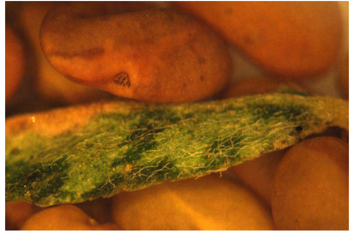
Fig. 5. Dried, but still living nematodes on the surface of leaf debris in a sample of "brown bag" alfalfa seed.

To verify that ASN is causing the symptoms in alfalfa, stems and leaves of symptomatic plants can