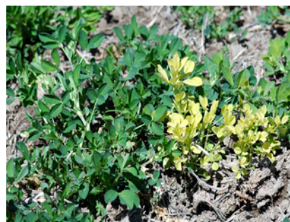
Fig. 3. Yellowing and stunting of severely infected alfalfa stems.

Infected plants tend to be stunted with very small "mouse eared" leaves. Infected stems have shortened internodes and swollen nodes (Fig. 2). Under the right climatic conditions, infected plants can appear yellow (Fig. 3) or even white in color (often called white flagging). This symptom is readily observed at green-up in the early spring or just after the first cutting. However, chlorotic flagging may be an indicator of other problems and alone does not indicate the presence of the ASN. Crinkled leaves are often observed on infected