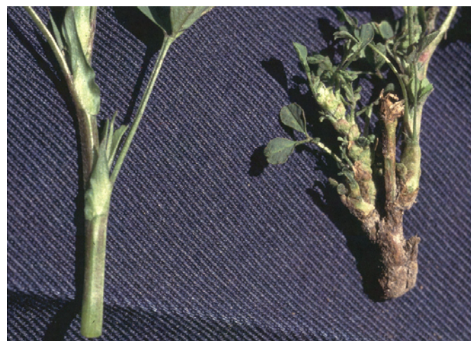
Fig. 2. Normal internodes with no swelling of nodes on healthy stem (left) compared with shortened internodes and swollen nodes on ASN infected stem (right).

weed pressure, and poor forage yield. Alfalfa production with moderate to severe ASN pressure (Fig. 1) rapidly becomes unprofitable within a year or two after planting.