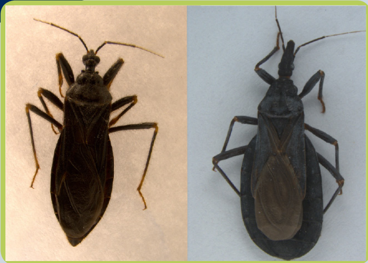
Above: Figure 3. Visual Comparison: masked hunter on left (rounded “head”); conenose bug on right (pointed “head”).

Sometimes people are concerned they may have contracted Chagas disease after being bitten by the masked hunter. Chagas disease, also called American trypanosomiasis, is a parasite ( Trypanosoma cruzi ) spread through the feces of a group of blood-feeding assassin bugs known as “kissing bugs.” Masked hunters are not true kissing bugs, nor are they true blood feeders. Masked Hunters do not harbor or spread Chagas disease.