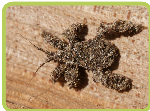
Figure 2. Masked hunter nymph covered with debris (Chap Chiswick, Wikimedia Commons).