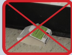
Top: Figures 3 & 4. Circle new pests so they aren't recounted during future inspections.