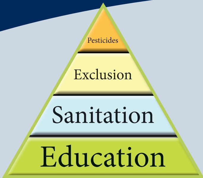
Figure 3: Integrated Pest Management (IPM) pyramid. The primary component of IPM is education, followed by sanitation and exclusion. Pesticides should be used only when absolutely necessary.