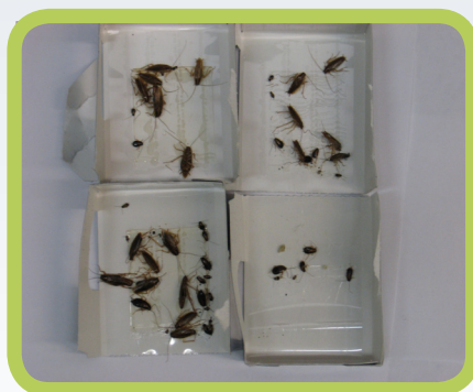
Right: Figure 2. Used pest monitors indicating the presence of cockroaches. Young roaches in a trap indicate that the trap is located near a “nesting” site where inspections and control efforts can be concentrated.