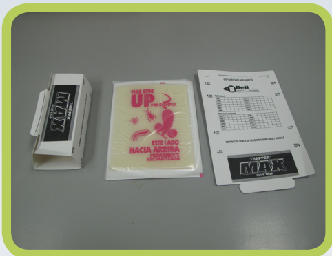
Above: Figure 1. Examples of arthropod pest monitors.