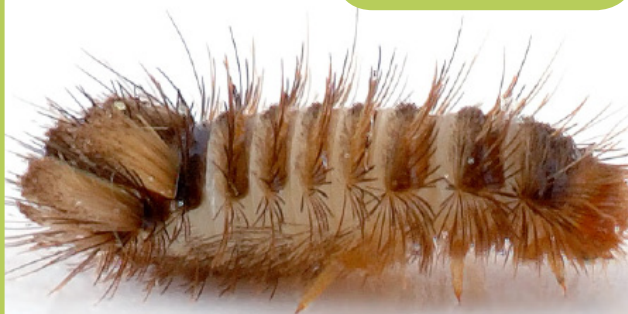
Right bottom: Figure 3. Carpet beetle larva (André Karwath).