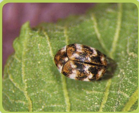
Above: Figure 1. Adult varied carpet beetle.