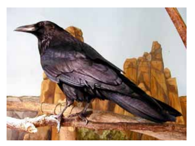
Fig. 4. Ravens are common in Utah and are more susceptible to West Nile Virus than other birds.

At least 138 bird species are susceptible to WNV and can die from an infection. In general, crows, ravens and jays are particularly sensitive to WNV and are the most commonly seen dead birds (Fig. 4). There is no evidence people can get WNV from handling live or dead birds infected with the virus. However, persons should avoid bare-handed contact when handling any dead animals, and use gloves when collecting dead birds in plastic garbage bags. Otherwise, contact local health department for guidance or bird removal.