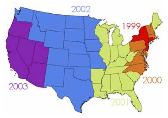
Fig. 1. Spread of West Nile Virus in the United States since first detected in 1999.

est Nile Virus (WNV) was first detected in Uganda in 1937. For several years, WNV remained relatively contained in Africa, Europe and the Middle East. Eventually, WNV was detected in North America in 1999 with the first cases in New York City. Since 1999, WNV spread to all the lower 48 U.S. states by 2004 (Fig. 1). WNV has also been detected in Canada, Mexico, Puerto Rico, Jamaica, Guadeloupe, El Salvador, and the Dominican Republic. More than 15,000 people have been infected with WNV in the U.S. since 1999. Unfortunately, more than 500 people in the U.S. have died as a result of secondary complications with WNV.