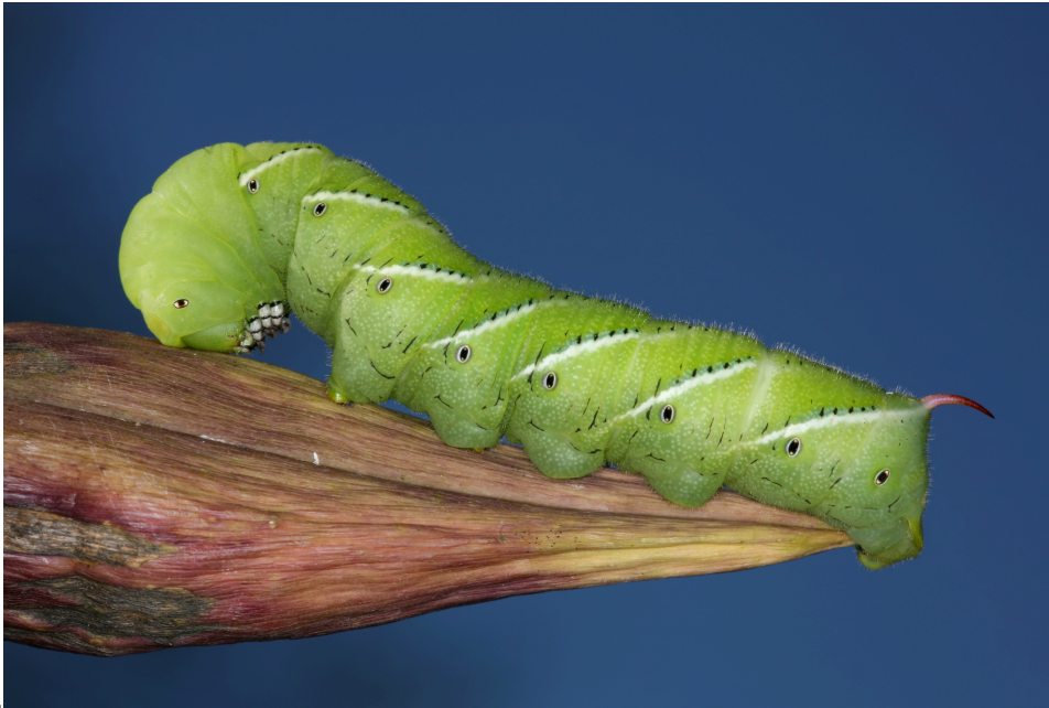
hornworm ( Manduca sexta ).