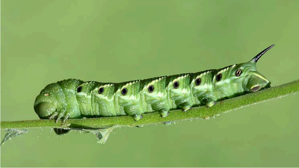
Fig. 1. Tomato hornworm ( Manduca quinquemaculata ).