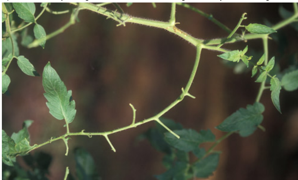
Fig. 7. Substantial defoliation on tomato plant caused by a single tomato hornworm.