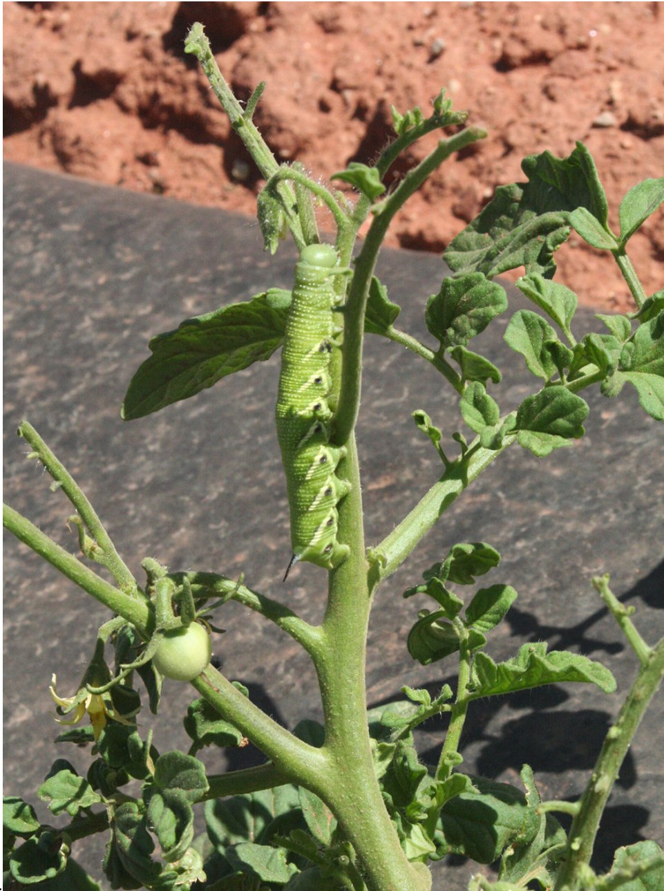
Fig. 6. Hornworm feeding on skin and flesh of tomato fruit. Image courtesy of