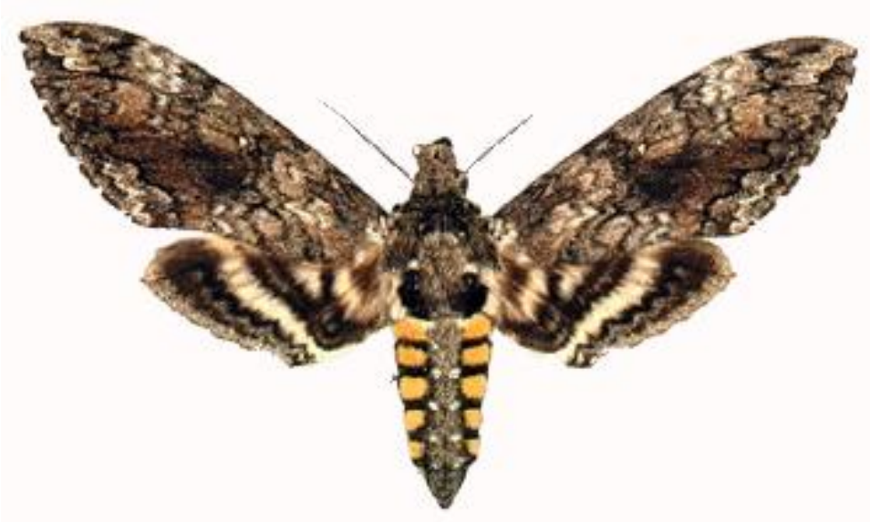
Fig. 4. Five-spotted hawkmoth ( Manduca quinquemaculata ), the adult stage of the tomato hornworm.