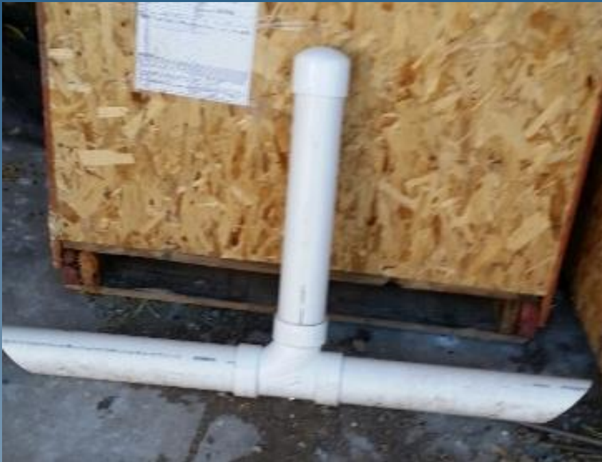
PVC Bait Station