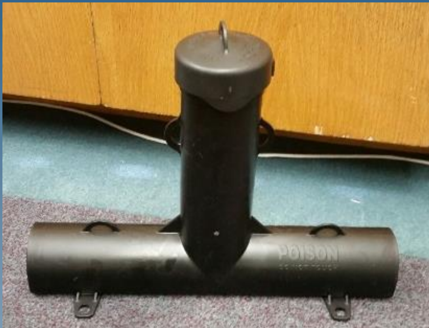
JT Eaton Bait Station