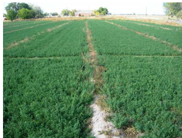
Figure 2. Alfalfa Stem Nematode treatment plots reseeded to alfalfa, 2008