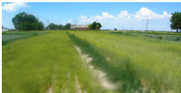
Figure 1. Alfalfa crop rotation treatments for Alfalfa Stem Nematode in 2007. Treatments shown are oats, upper left; camelina, and canola.

Oasis, Millard County, Utah Established in March 2007