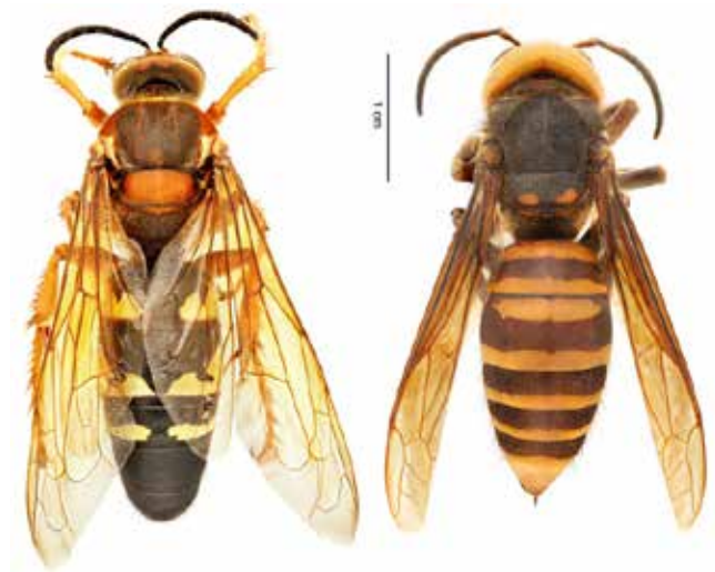
A cicada killer wasp (left) and an Asian giant hornet (right). While similar in size, the cicada killer abdomen is usually black in color, with bright yellow markings, whereas the Asian giant hornet has a striped appearance.