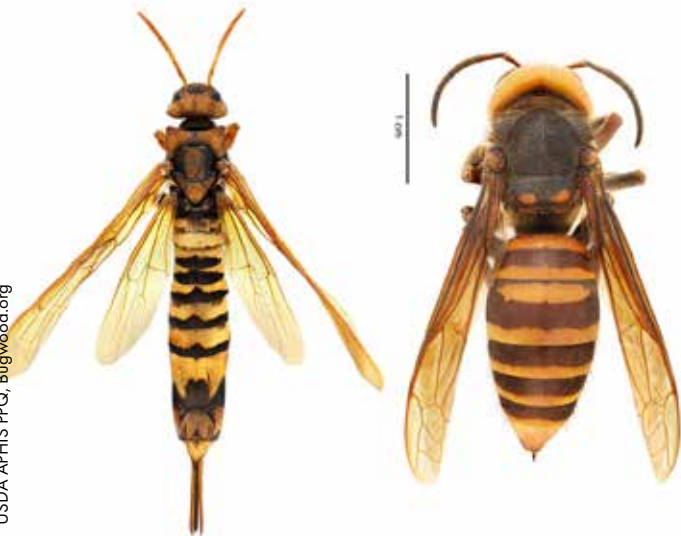
A horntail wasp (left) and an Asian giant hornet (right). Note the thick protrusion extending out of the abdomen of the horntail, a key identification feature that Asian giant hornets do not possess.