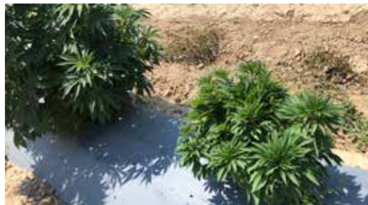
Stunted but otherwise healthy-looking plants were commonly seen. These plants often developed chlorotic foliage as they matured, and produced low yields.