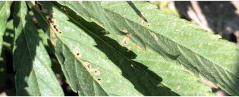
Flea beetles were found on just a few farms, along with symptoms of their feeding damage.