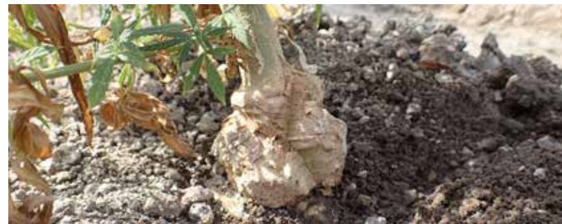
Crown gall is a bacteria-caused disease found on one farm. Affected plants were stunted and some died.