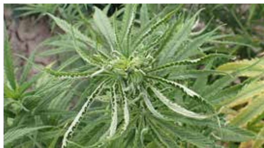
Stunting associated with upward-curled and twisted foliage.