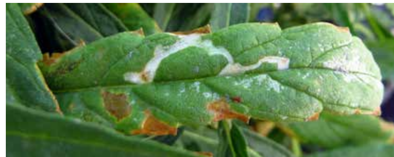
Leafminer damage was sporadic, with no larvae found within the mines to allow species identification.