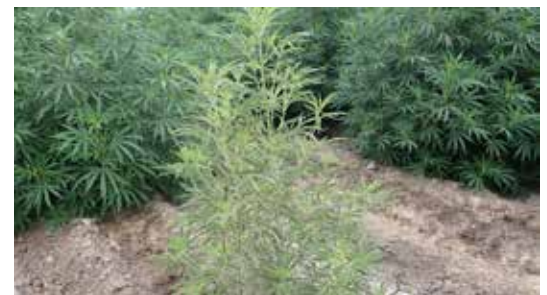
Some plants start from seedlings with thin, curled leaves, and remain that way.