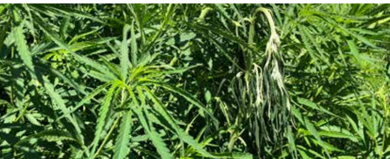
Fusarium was found on a few farms, causing a wilting in a portion or in the entire plant.