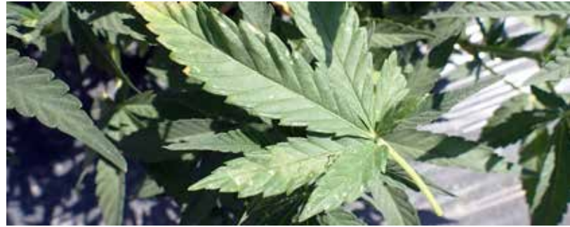
Thrips feed by piercing the plant surface with their mouthparts and sucking the contents of cells, causing white spots.