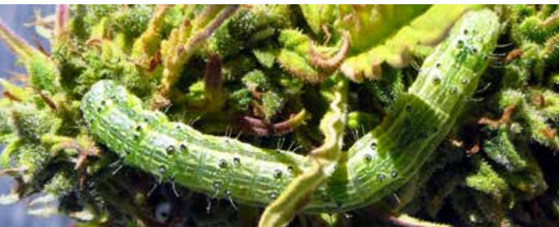
Beet webworm (shown above) and corn earworm were the only caterpillar pests found in 2020.