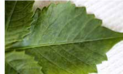
Symptoms of Dahlia mosaic virus include stunting (top left), vein-clearing on leaves (top right), color breaking on petals (lower left), and mosaic patterns (lower right).