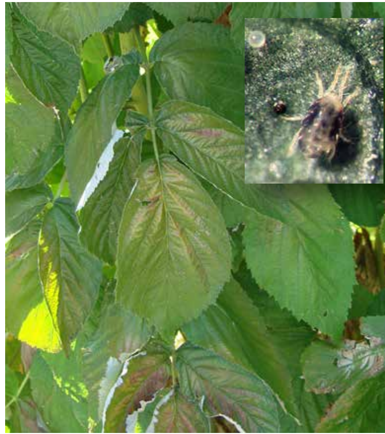
Heavy feeding of two-spotted spider mite (inset) causes a scorched appearance of raspberry foliage.

Beyond chemical and physical controls, reduction in heat and dust can lower the risk of spider mite infestations. For