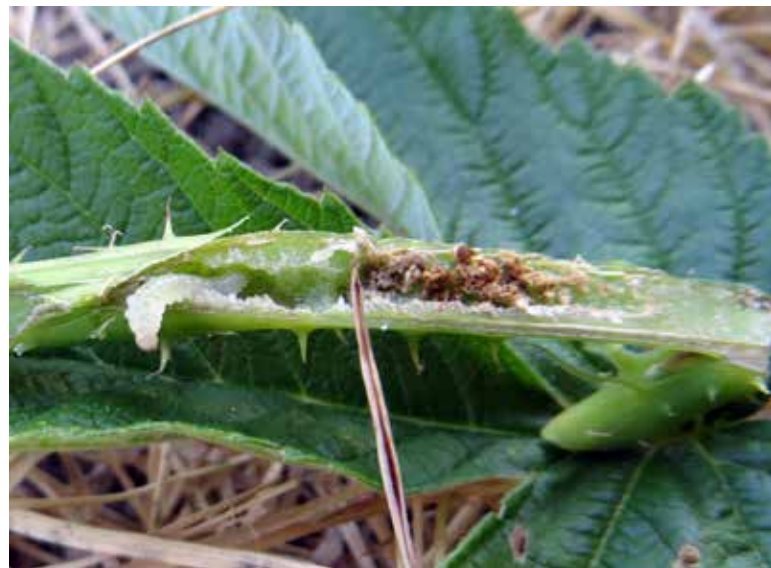
Raspberry horntail attacks raspberry canes, and are among the primary pests of raspberries in Utah.

Other arthropod pests that attack berry fruits include the European earwig, several fruit-eating wasps such as the yellow jacket and European paper wasp, various stink bugs like the green stink bug and the invasive brown marmorated stink bug, lygus bugs, thrips, grasshoppers, and spider mites. However, these pests are not likely to be mistaken as “worms” due to their appearance and feeding habitat. Other insects that infest raspberries in Utah include raspberry horntail, rose stem girdler, and raspberry crown borer. The larvae of these insects are the damaging life stage, and therefore, might be called “worms” by the public; however, the larvae feed on raspberry canes – not the actual berries.