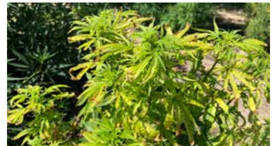
Plants with chlorotic foliage were tested for nutrient deficiencies, and many results showed adequate nutrient content.