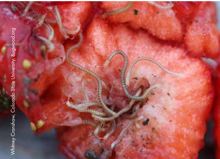
Whitney Cranshaw, Colorado State University, Bugwood.org

In Utah, it is unlikely that “worms in berries” are of the invasive spotted wing drosophila (SWD). SWD larvae are 1/16 to 1/6 inch long, tapered at both ends, legless, and cream-colored with black mouthparts. This Asian vinegar fly was first detected in the state in 2010, and our extensive annual trapping and fruit inspections have only detected adults, and have never found fruit damage due to SWD larvae. We trapped adults in cherry, peach, apple, plum, apricot, berry, and grape crops in both commercial orchards and home gardens. In addition, adults have been caught in traps in wild habitats, especially riparian areas, with river hawthorn, serviceberry, wild rose, dogwood, and other wild fruits. The 2020 survey updates are posted online at utahpests.usu.edu/caps/survey .