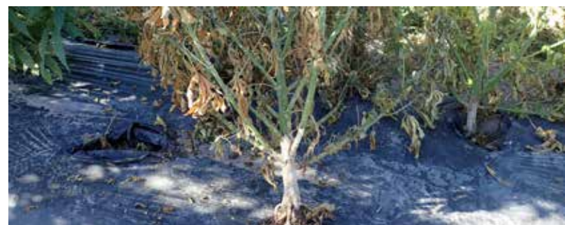
Pythium crown rot is a deadly disease tied to saturated soils.