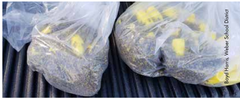
Boyd Harris, Weber School District

The standard yellow Rescue trap has been shown to be an effective trap. It is important to wear protective clothing when treating yellowjackets or checking traps.