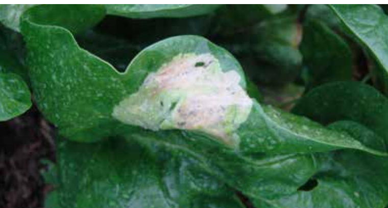
Leafminer ‘mine’ in spinach leaf in a Utah garden.

Allium leafminer causes onion plants to twist and deform (top).