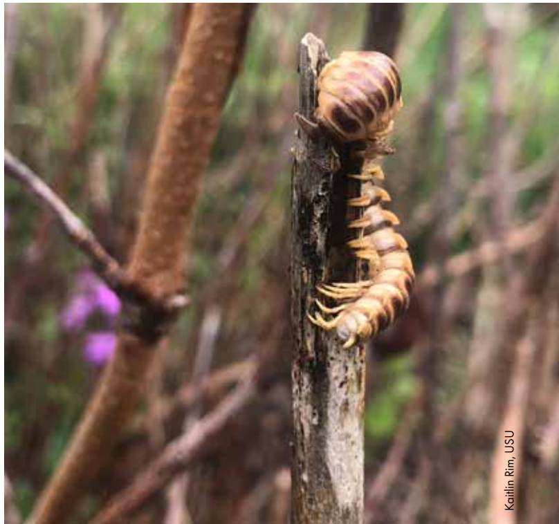
Katlin Rim, USU

Sometimes entomopathogen-infected arthropods behave strangely, almost like the disease is controlling their mind! Virus infected caterpillars like this soybean looper (left) will climb up and die with their hind limbs firmly grasping the undersides of leaves or stems. When the insect exoskeleton breaks, virus particles drip onto the leaves below. This millipede (right) is infected by an entomopathogenic fungus that forces hosts to climb about 3 ft high before they die. This climbing behavior helps the fungus grow and disperse to other areas.