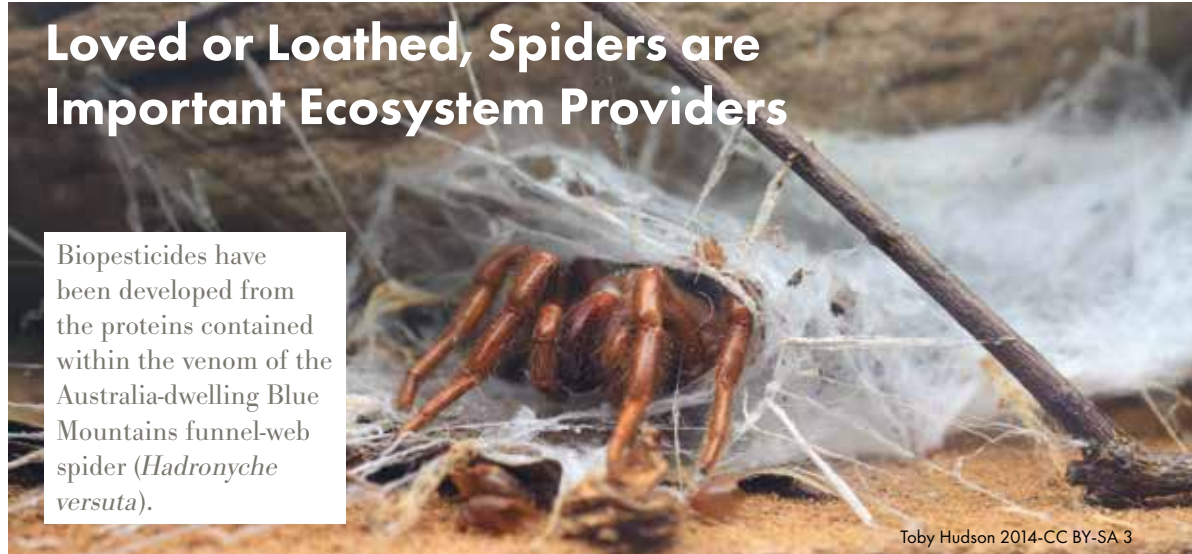
Toby Hudson 2014-CC BY-SA 3

Biopesticides have been developed from the proteins contained within the venom of the Australia-dwelling Blue Mountains funnel-web spider ( Hadronyche versuta ).