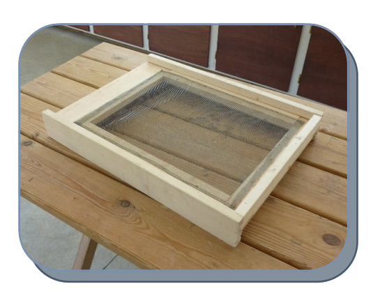
Fig. 1 Screened bottom to reduce varroa