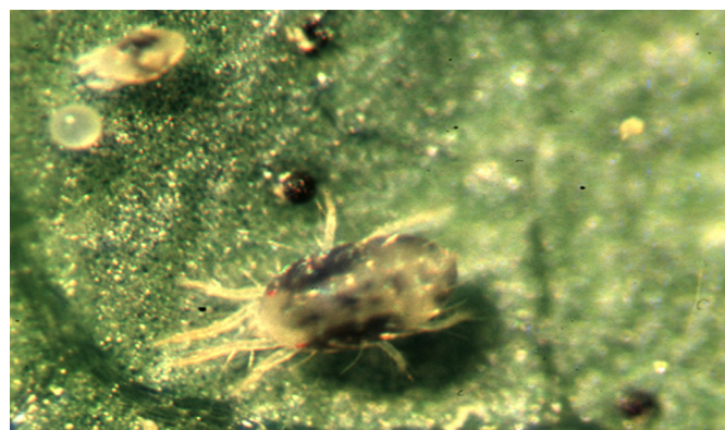
Two spotted spider mite adult, immature and egg.

Twospotted and McDaniel are the two most important web spinning species of spider mites (Order Acari, Family Tetranychidae) to attack Utah fruit orchards. However, twospotted spider mite tends to have a higher reproductive rate during hot summer conditions. For that reason, when both species occur together, twospotted spider mite often out competes McDaniel spider mite. Although 1 USDA ARS, Wooster, OH