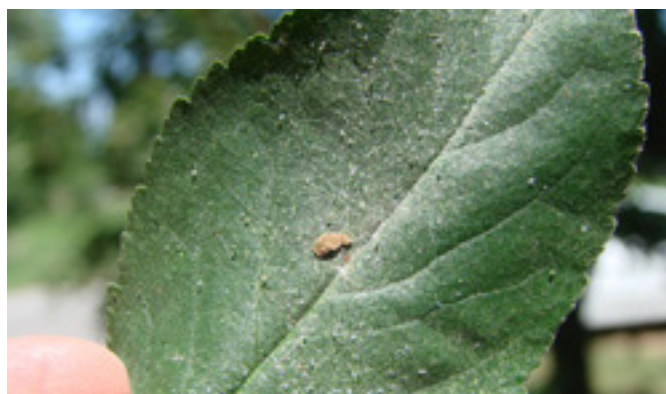
Spider mite injury to a tart cherry leaf; note stippling and debris caught in webbing on the leaf surface (Utah State University Extension).