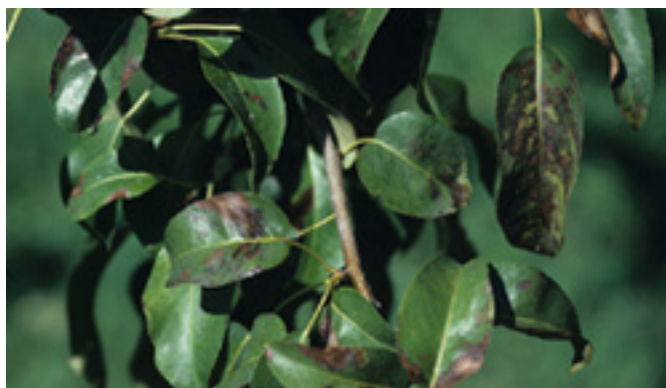
Spider mite injury to pear can cause rapid and severe leaf burn.