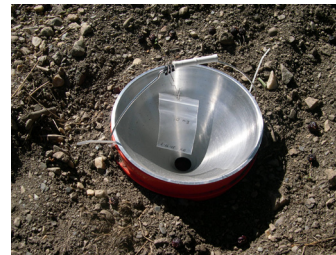
Fig. 5A. Bucket trap with experimental prionus pheromone lure.

Adult prionus can be monitored using pheromone and light traps. The Prionus californicus sex pheromone has been identified and found to be highly attractive to male beetles. Studies in northern Utah have found that hanging the pheromone lure over a funnel placed in a buried bucket can be an attractive trap to the male beetles (Fig. 5 A and B). In a sweet cherry orchard in 2009, males were captured in traps during July and August; more males were caught in bucket than panel traps, and more were caught in pheromone-bated (Phero) than non-baited (Untrt) traps (Fig. 6.) In 2010, males were caught in pheromone-bated traps from July through September. A commercial pheromone lure is expected to be available soon. If pheromone traps are attractive enough, they may be successful in reducing the local Prionus californicus population (i.e., mass trapping). The beetles typically fly soon after sunset, and they are attracted to lights. Trap-catch may decline after midnight, presumably due to colder temperatures. Adults begin to emerge in early July in northern Utah, and probably 2-4 weeks earlier in southern Utah.