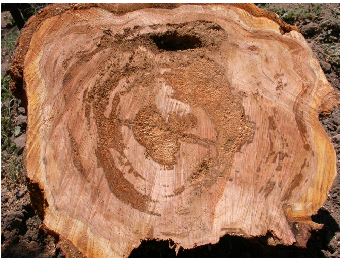
Fig. 4. Cross-section of crown of a sweet cherry tree showing circular pattern of prionus tunnels.

Sandy soils appear to favor prionus infestations. Not only is sand likely to increase the ease with which larvae can move about, but it allows rapid percolation of irrigation water. The loss of water from the soil profile combined with the tree's reduced ability to uptake water (due to prionus feeding) can become major stressors, even for well-established trees.