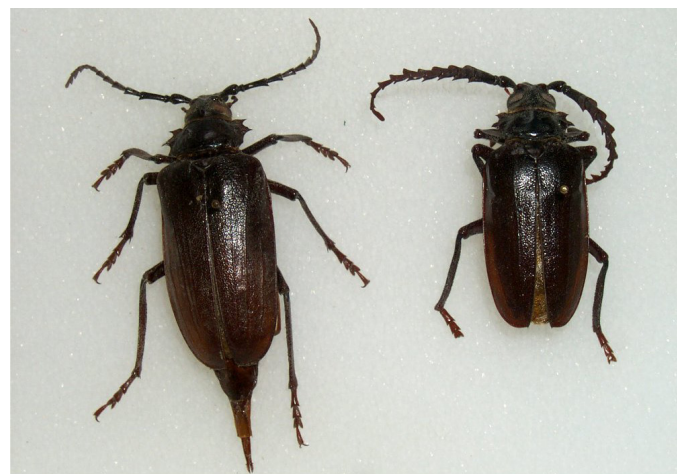
Fig. 1. Adult prionus root borer, female (left) with ovipositor extended, and male (right) with larger antennae for detecting female sex pheromone.

The adult California prionus is a large beetle, ranging in size from 1¾ - 2¼ inches long (45-60 mm). Adults are reddish-brown in color, relatively smooth and shiny with long, deeply notched antennae (Fig. 1). The larvae can be as long as 4¼ inches (108 mm) with a diameter of approximately ¾ inch (18 mm) at the widest point of its body (Fig. 2).