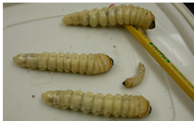
Fig. 2. Prionus larvae of various ages, ¾ - 4¼ inches long.

Adults emerge from pupae in the soil in July in northern Utah. The beetles fly at night in search of mates, and eggs are laid in the soil soon thereafter. Young larvae tunnel into the soil to seek out tree roots. Research in a Utah sweet cherry orchard suggests that the younger larvae begin feeding on smaller diameter roots and ultimately reach the tree crown as mature larvae as they move inward and upward along larger roots. The "crown" refers to the region of the trunk (usually at or near the soil level) that represents the transition between below-ground (roots) and above-ground (trunk) growth. In cherries, a greater proportion of the larvae found at the crown were large, mature larvae, while most of the