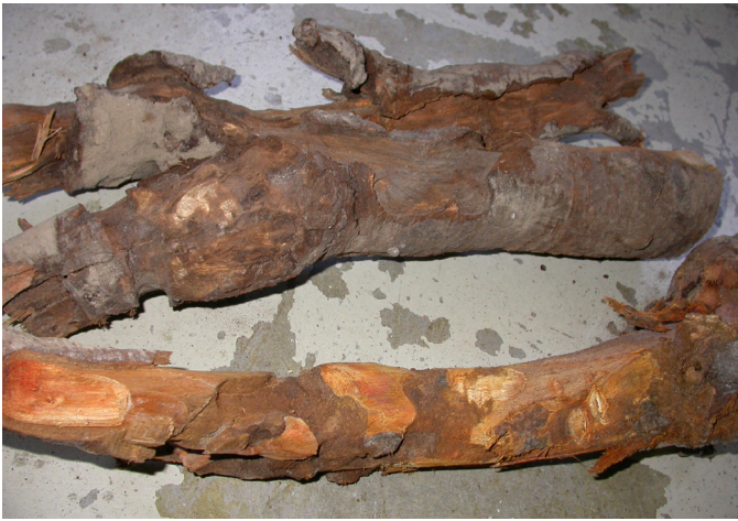
Fig. 3. Furrows in sweet cherry roots made by prionus larvae.

Larvae will chew deep furrows in the roots (Fig. 3), often causing severe reduction in a tree's ability to take up water and nutrients. The feeding injury is often associated with rot and decay, particularly in wet soils. The colonization of feeding wounds by soil microbes will compound the damage caused by larval tunneling. Larvae feeding in the crown form spiraling furrows which girdle the crown and upper roots (Fig. 4).