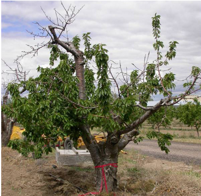
Fig. 7. Sweet cherry tree decline due to prionus infestation.

larvae. Alternatively, more soil can be unearthed to search for infestations on roots. Usually, infested trees will show signs of limb dieback or a marked decline in overall vigor during hot spells (Fig. 7).