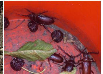
Fig. 5B. Prionus males caught in bucket trap.