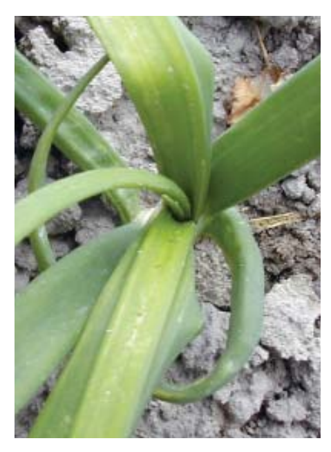
Fig. 8 . Thrips prefer to hide in the lower neck of onion plants.<sup>1</sup>