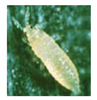
Fig. 4. Young larva is white to pale yellow in color with elongate body.<sup>3</sup>

• Instars I and II (0.02-0.04 inch; 0.5-1.0 mm in length) are active, feeding stages.