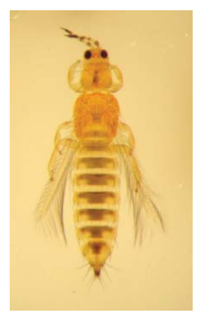
Fig. 7 . Western flower thrips adult is darker yellow in color and slightly longer than onion thrips; also, it has 8- rather than 7- segmented antennae.<sup>2</sup>

Other species of pest thrips are found on onions in Utah. Of these, the western flower thrips (WFT), Frankliniella occidentalis , is the most common. Thrips surveys conducted in Utah onion fields since the 1990s have found WFT numbers to be 10 to 100 times lower than onion thrips. WFT is slightly longer (0.08 inch or 2.0 mm) and darker yellow than onion thrips (Fig. 7). Viewed through a microscope, WFT can be distinguished from onion thrips by its 8-segmented antennae and longer setae (hairs) on the segment just behind the head (prothorax). WFT reproduces sexually; males and females are common. WFT densities in onion are higher in the late summer, especially on plants that have bolted and produced seed. In Utah, WFT are much less important to onion crop damage than onion thrips.