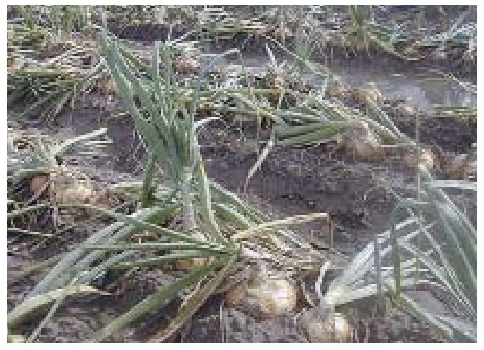
Fig. 5 . Heavy thrips feeding injury causes onions to wither and senesce early.<sup>1</sup>