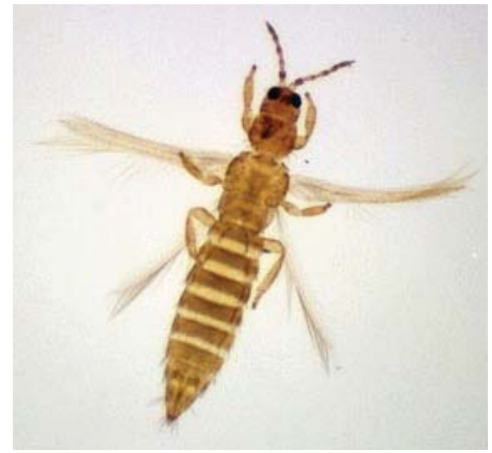
Fig. 2. Adult onion thrips have fringed or hairy wings and 7-segmented antennae.<sup>2</sup>

unsustainable management. Life history characteristics of onion thrips that enhance their pest status include a short generation time, high reproductive potential, asexual reproduction by females (parthenogenesis), and occurrence of protected, non-feeding life stages. Recent research has shown that the majority of onion thrips on a plant are in the non-feeding egg stage (60-75% of total population on an onion plant during late June to August), and thus, not exposed to insecticides and other suppressive tactics. Multi-pronged pest management strategies that boost onion plant health and tolerance to thrips, in addition to suppressing thrips densities, have proven the most sustainable and economically viable.