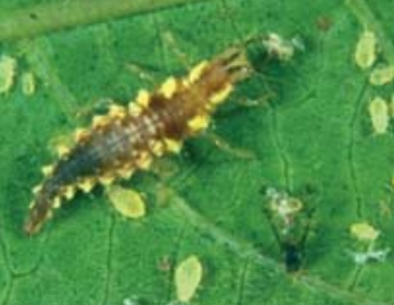
Fig. 10. Natural enemies of thrips (clockwise starting from lower left): green lacewing larva<sup>5</sup>, black hunter thrips<sup>2</sup>, big-eyed bug<sup>6</sup>, and minute pirate bug<sup>7</sup>.