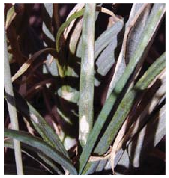
Fig. 6. Iris yellow spot virus (IYSV) spindle-shaped lesions on onion leaf. ^{\rm 4}

Onion thrips can vector plant viruses. Within the last 10 years, the introduction of iris yellow spot virus (IYSV, a tospovirus) into Utah and other western states has caused significant economic losses to the onion industry. IYSV causes lesions on onion leaves and flower scapes. Lesions are straw- to tan- colored, and spindle- to diamond-shaped (Fig. 6). Under some conditions, the disease may spread rapidly causing plants to senesce early and dramatically reduce bulb size. Onion thrips can also vector other viruses, such as tomato spotted wilt virus (TSWV) and impatiens necrotic spot virus (INSV), and although these can be economically important to greenhouse and nursery plants, they are not a concern on onions.