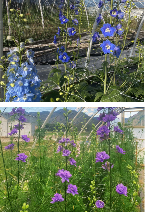
Delphinium (top) and larkspur (bottom) production.

In Utah, the popularity of cut flowers is steadily increasing, drawing economic, cultural, and agricultural interest. As of 2023, there are 199 known farms cultivating flowers within the state. Two species, delphinium and larkspur, have gained prominence amongst florists and growers, with 72% of cut flower farmers growing them in 2022. Delphiniums are short-lived perennials, recognized for their tall spikes adorned with densely packed, vibrant, and delicate blossoms in various colors, including unique shades of blue. Larkspur, a closely related annual species, boasts gracefully spikes of airy spurred blossoms in a spectrum of soft colors. As cut flowers, both species are captivating, lending an elegant and dramatic line that provides height and balance to floral arrangements. Nationally, both flowers hold economic significance for the cut flower and potted plant industry. In 2023, the Boston Terminal Market priced one bunch of ten delphinium stems at $17.50-$20.00, and ten bunched larkspur stems at $12.50-$15.00, as provided by the USDA AMS Specialty Crops programs.