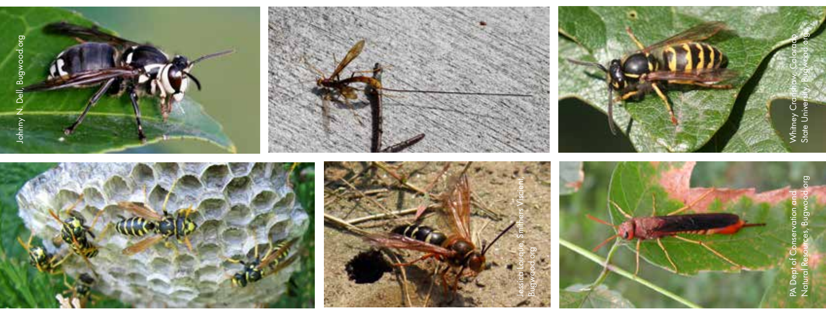
Insects possibly mistaken for the Asian giant hornet: bald-faced hornet ( top left ), giant ichneumon wasp ( top middle ), western yellowjacket ( top right ), European paper wasp ( lower left ), cicada killer ( lower middle ), pigeon tremex ( lower right ).

the best we can do is compare habitats and other environmental parameters from Asia to Utah's.