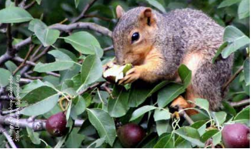
Fox squirrels may feed on fruits, such as pear ( left ). In winter, they chew bark away and feed on the subsequent sap flow ( middle ). The bark damage is identified by the chew marks ( right ).