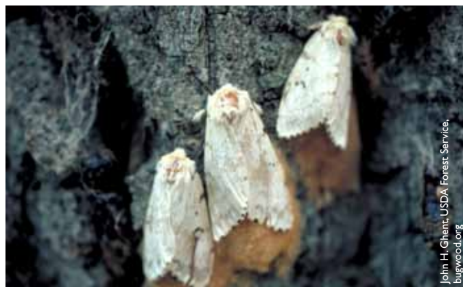
Gypsy moths lay large masses of eggs, primarily on trees. But sometimes eggs are laid on cars, trucks, or trailers, leading to possible spread to uninfested areas such as the western U.S.