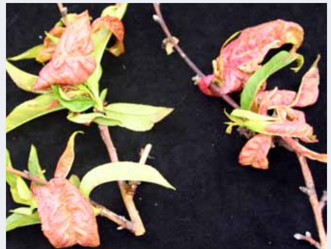
Peach leaf curl is a disease caused by the fungus Taphrina deformans . Infections occur only during cool, moist conditions, causing puckered, deformed leaves. It is treated by a single application of copper or chlorothalonil at leaf drop.

Infections occur only during temperatures between 50 and 70°F. Disease incidence is highest and most noticeable during wet conditions. During cool temperatures, expansion of