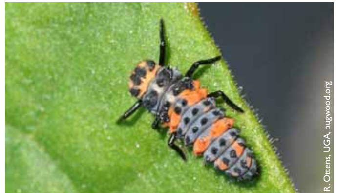
Top: Adult damsel bugs wait for insects such as aphids to approach. Middle: Big-eyed bugs eat eggs, mites, aphids, and other small insects. Bottom: Lady beetle larvae are colored black to dark purple with spots of orange.

can be encouraged by providing them with alternative food resources and shelter. In general, diverse cropping systems and flowering plants may be a way to enhance predator activity. When sampling and monitoring pests it is important to also monitor predator populations and incorporate them into an integrated pest management program.