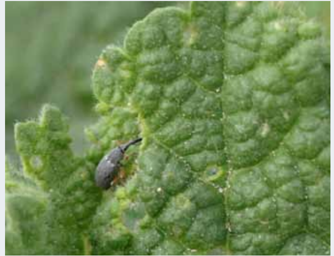
Hollyhock weevils are beetles with mouthparts located at the tip of a snout. The weevil uses its snout to feed on foliage and also to chew cavities deep into flower buds in which to lay several eggs. The hatched larvae then feed on the seed that develops after flowering.

Chemical options include soft approaches such as insecticidal soap or horticultural oil. Pyrethrin, Sevin, Orthene, or Malathion may be used as a last resort. Spraying will be most effective if done in late evening. Keep in mind that broad spectrum insecticides may also kill beneficial insects.