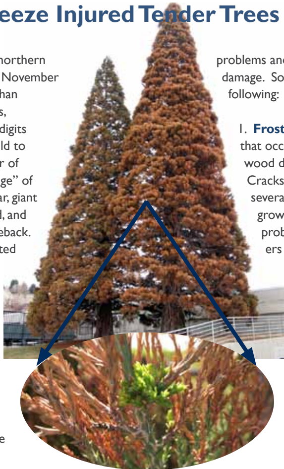
Where the buds survived, new shoots and foliage are seen emerging on “brown” conifer branches.

Damage to deciduous plants is more difficult to discern, and also is more difficult to blame on the November freeze due to the wide array of