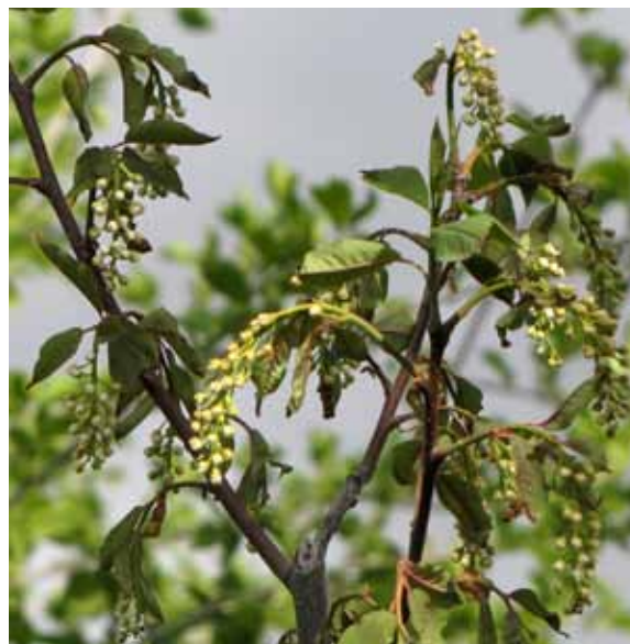
Some trees, including peach and this chokecherry, expanded their spring foliage, but the loss of water transport capacity resulted in wilting soon afterward, and in some instances, tree death.

problems and the length of time it takes to see the damage. Some of what happened includes the following: