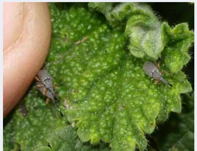
Hollyhock weevils are promiscuous in the garden, and the smaller (but domineering) male will often remain with the female to keep other males at bay.