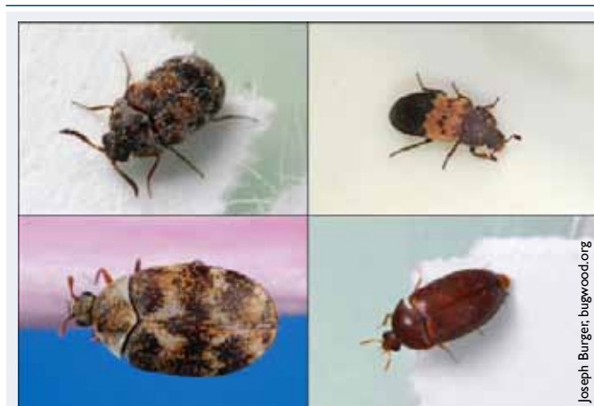
Adult carpet and hide beetles common in Utah homes: (top left) Trogoderma sp., (top right) larder beetle ( Dermestes lardarius ), (bottom left) varied carpet beetle ( Anthrenus verbasci ), and (bottom right) black carpet beetle ( Attagenus brunneus ). Adult beetles are small, ranging in size from 2 mm to 10 mm.

3. Eliminate infested products. Once the infestation is located, remove infested items from the home.