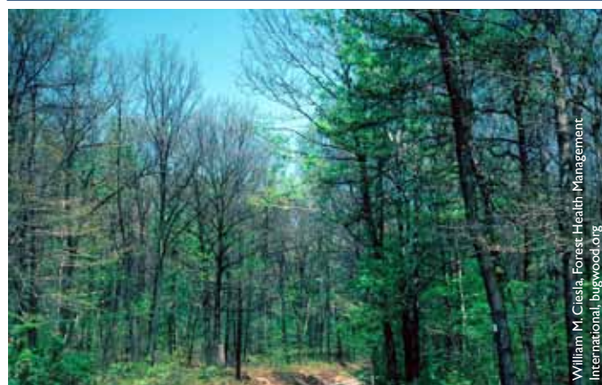
Feeding by gypsy moths can lead to complete defoliation of trees. Typically, trees refoliate, but when gypsy moths feed year after year, as seen in eastern forests, some trees cannot recover.