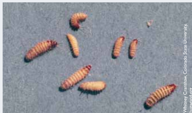
Immature dermestid beetles (larvae) can grow up to 13 mm in length depending on the species, and can be mistaken for duff millipedes or other immature insects. Have your larvae identified to discern which insect is present.