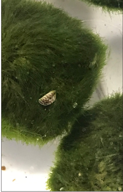
Fig. 13. A moss ball sold in pest stores that contains an invasive zebra mussel.

moss ball is a species of green algae that is formed into a 2- to 5-inch diameter ball for use in home aquariums. The USFWS, the Pet Industry Joint Advisory Council (PIJAC), and the Utah Division of Wildlife Resources (DWR) are urging pet and aquarium stores and aquarium owners to treat all purchased moss balls as though they are infested with zebra mussels and to properly destroy these materials to mitigate the risk of introduction. Decontamination is highly recommended and is essential if mussels are observed. Keep in mind the veliger stage is microscopic and therefore not easily observed (PIJAC, 2021, USGS, 2021).