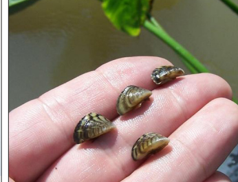
Fig. 2. Quagga mussel ( D. bugensis ) adults.