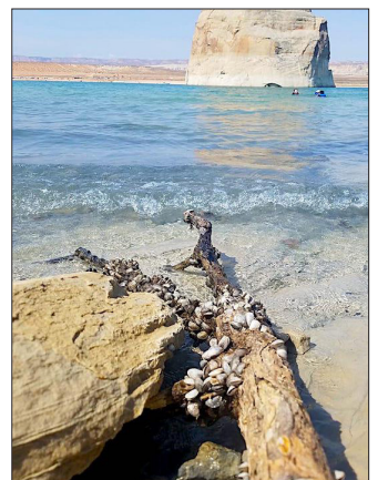
Fig. 10. Quagga mussels on the shore at Glen Canyon National Recreation Area.