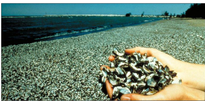
Fig. 1. Zebra mussels (D. polymorpha) on beach.

The quagga mussel and the zebra mussel (Order: Veneroida, Family: Bivalvia) (ZQM) (Figs. 1-3) are two-shelled mollusks native to the Caspian and Black Seas in eastern Europe and western Asia that spread rapidly and can severely disrupt aquatic ecosystems and critical water infrastructure systems. In North America, these invasive dreissenid mussels were first discovered in the Great Lakes in the late 1980s from discharged contaminated ballast water from ships arriving from Europe or through mature adults attached on anchors stored in the internal compartments of these ships. Within three years, they had been detected in all five Great Lakes. Currently, the Columbia River Basin is one of the few remaining areas in the U.S. that is free from these invasive mussels.