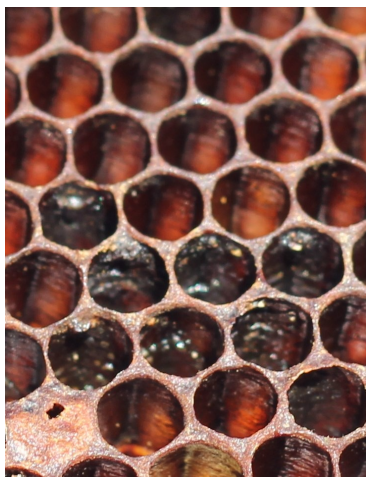
Fig. 1: Prepupae form dark “scales” in their cells, which the bees cannot remove.

In order to make a proper diagnosis, be familiar with signs of the disease: