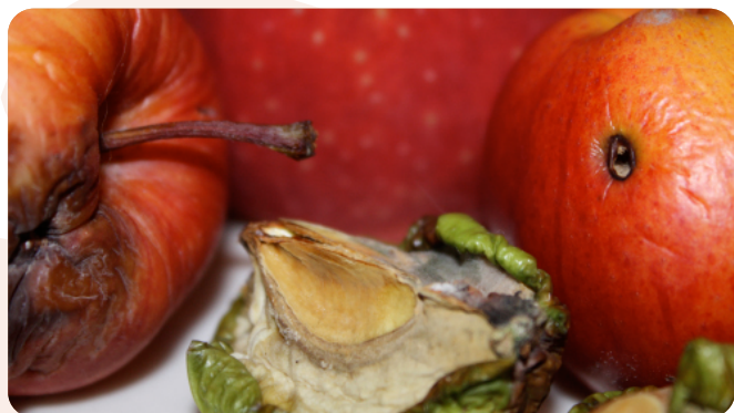
Apples gathered from USU Campus.

You've seen them melted onto sidewalks and piled in gutters: Bruised, smashed and baked by the sun, bountiful fruit harvests left for the birds and worms. With a little planning, this bounty could be yours. Foraging for fruits is a safe bet, especially with well-known and easily identified varieties like plums, apricots, apples, and cherries. Fruit found falling and rotting on public and private with permission land is a good sign that it is not wanted, and you can help yourself. If you notice neighbors with fruit trees with fallen fruit you can knock on doors and ask them if they would like some help with their harvest.