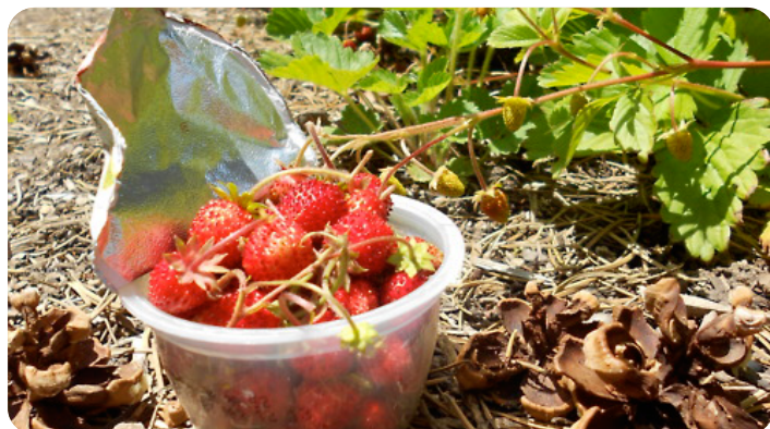
Alpine Strawberries ( Fragaria vesca )

Check the weather forecast for a good day and a half of hot weather before starting fruit leather. (85 degrees and up!) Wash and cut the tops off of collected strawberries. Puree in a food processor. For each cup of pureed strawberries, add 3/4 tablespoon of lemon juice and 1 tablespoon honey. Pour a cup of prepared puree onto each cookie sheet and spread evenly, cover with cheesecloth. Find a hot spot outside. The goal is to bring the fruit between 100 and 140 degrees Fahrenheit. You'll want to start the drying process as early in the day as possible. Check drying fruit occasionally, over a day and a half time period. By the end of the second day your fruit leather should be dried and ready to be pulled from the pan and enjoyed. Finish drying your leather in an oven on low temperature if it hasn't dried after two days.