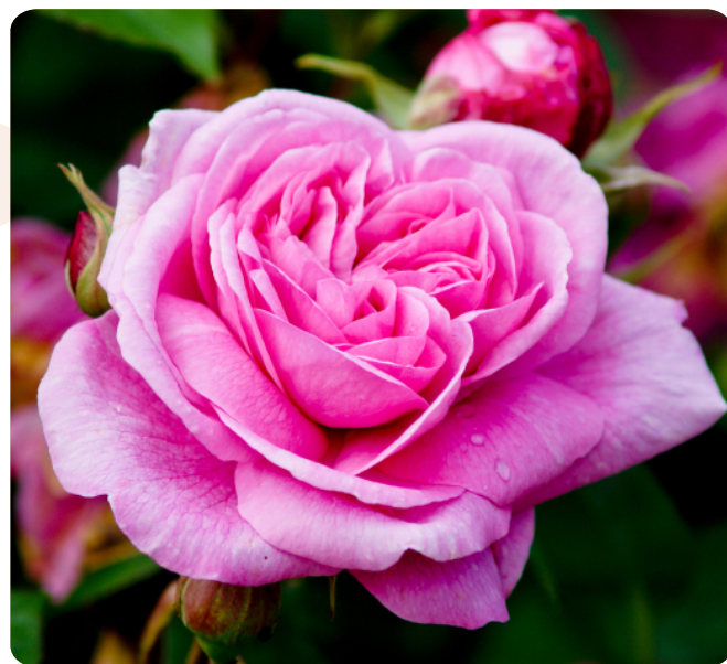
Rose ( Rosa rubiginosa )

All roses are edible when they are not grown using heavy applications of pesticides. When foraging, check to see if the buds and blossoms have any bugs in and/or around them. If there are no bugs, it is more than likely that the bush has been treated with pesticides and is not safe to eat. For the best flavor, use your nose to find the most pungent roses and harvest before the heat of the day. Both the petals and the rosehips are edible. Before using rose petals, cut off the bitter white end of the petals. Roses are great in scones, cakes, sherbets, salads and icings.