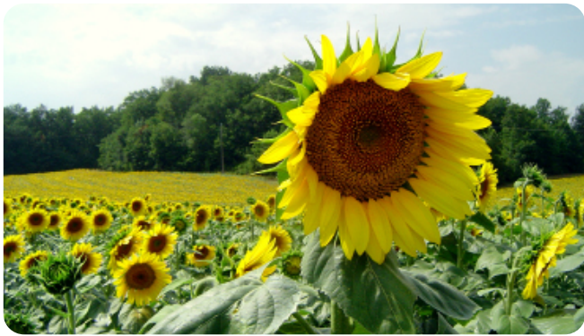
Sunflowers ( Helianthus annuus )