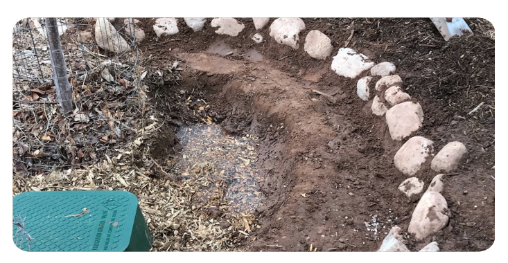
Installing earthworks for a gravity-fed graywater system in Moab, UT (pipe outlet into green mulch shield).

Graywater is an abundant resource in both residential and commercial buildings. According to Brad Lancaster of Rainwater Harvesting for Drylands and Beyond, "graywater harvesting is the practice of directing graywater to the primary root zone (top 2 feet or 0.6m of the soil) of perennial plants to help grow beautiful and productive landscapes while achieving wastewater treatment without using energy or chemicals. Plants and microorganisms in the soil consume and filter the organic nutrients and bacteria found in graywater, treating it naturally and returning clean water to the water cycle" (2010, p.294). Though not suitable as drinking water, graywater can be used for irrigation, even for growing fruit on trees and shrubs with woody stems that serve as additional filters for any contaminants that may be present.