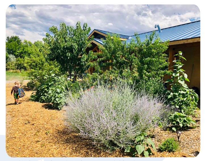
Utah's first legal residential graywater-fed landscape, supporting two cherry trees, a nectarine and a peach tree, currants, and a variety of flowers.