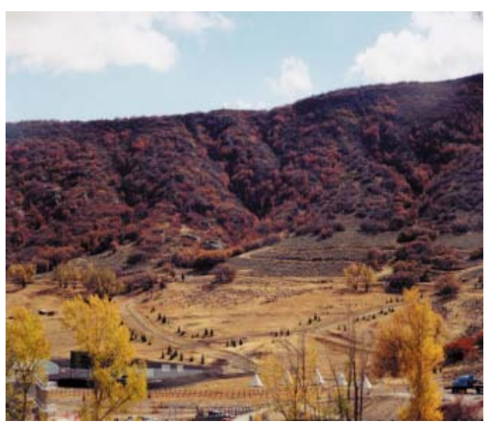
Soldier Hollow/Wasatch State Park in the fall

state travel to rural areas for recreation, as do many out-ofstate tourists. This puts a higher level of pressure on rural resources and infrastructure. Long-term and consistent sources of funding are important for rural areas. Longterm resource protection and amenity/ecological service values are statewide concerns. Funding should be used to encourage Planning Districts to help protect these broader social values.