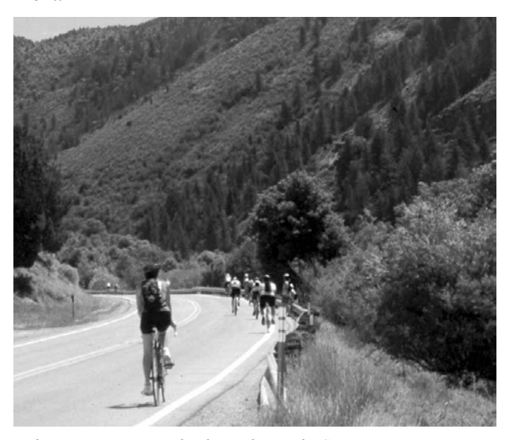
Bikers racing in Blacksmith Fork Canyon

problems or needs for specific towns and communities in your region of the state? Participants were asked to focus on needs related to parks, trails, greenways, wildlife areas, wetlands, and other natural areas that are available for public use, recreation, and tourism. Utilizing a nominal group process, a total of 414 items were generated by participants in response to Question #1 and 242 items in response to Question #2. At least thirty, prioritized, open space needs were identified for each of the seven Planning Districts, including over 200 specific items for the Wasatch Front.