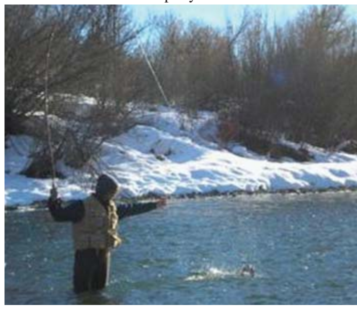
An Oneida Narrows angler hooks a trout

Repeat visitors were also asked about the approximate number of trips per year they made to the area. The median response to this was six times per year, although about 14% of respondents indicated they visited 50 or more times per year.