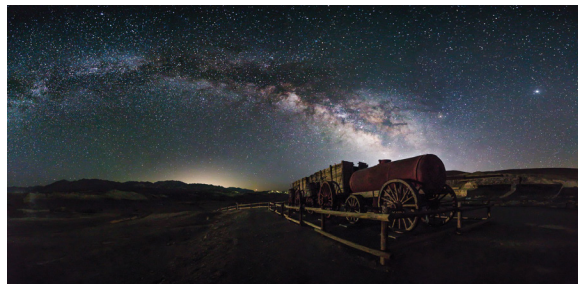
Harmony Borax Works, Furnace Creek, CA

The White Pine Main Street Association received a second Travel Nevada rural marketing grant for $10,000 (July 2021-June 2022) to design the Park to Park in the Dark website and brochure.