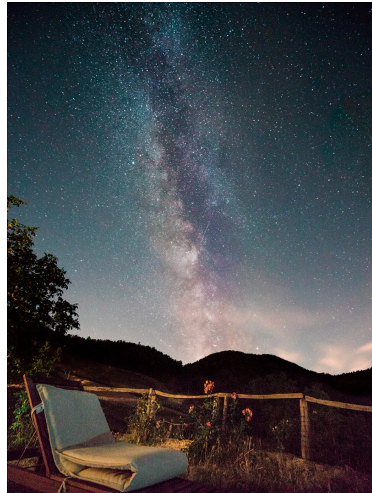
Photo credit: Samuele Errico Piccarini Parco Nazionale Foreste Casentinesi, Pratovecchio, Italy

The audio file was carefully developed with many pilot listeners and is tailored to the experience with timeless music, stories, and astromical explanations. It can be licensed by Visit Dark Skies and offered free of charge. Visitors can purchase and stream it through the Visit Dark Skies website, with hosts as distributors. The audio file is available in English and German.