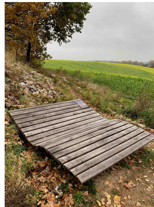
Starry Sky Bench in the Nossentiner / Schwinzer Heide, Germany