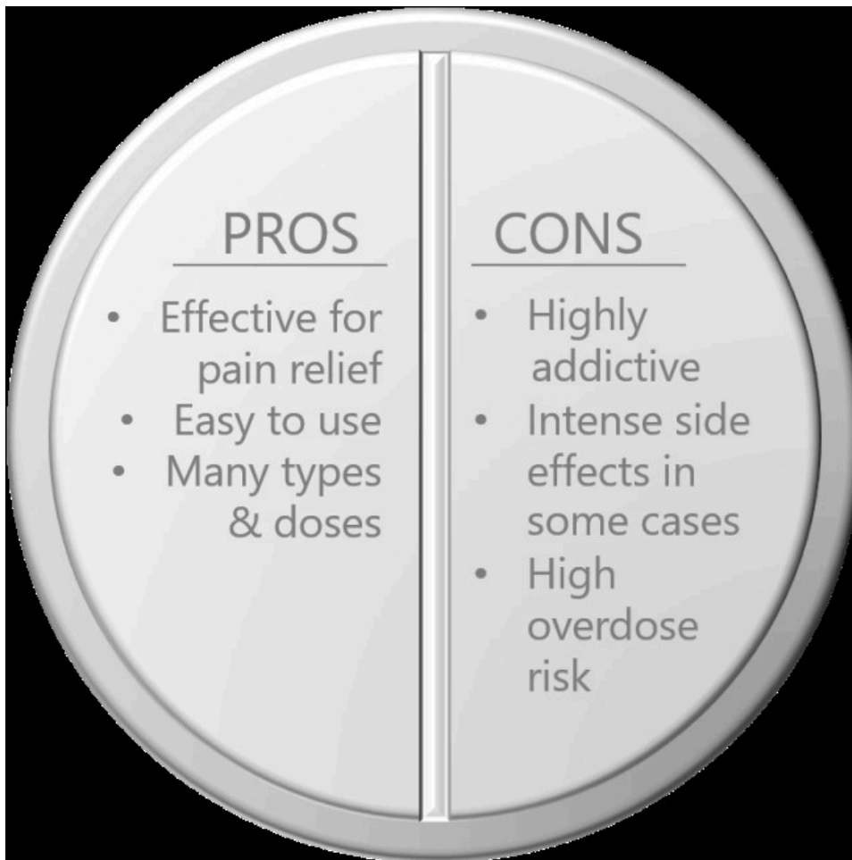
Figure 2. Pros and Cons of Opioid Usage for Pain

As such, opioids may not be the best option for patients seeking cost-effective, long-term treatment (Gatchel, et al., 2014). Opioids, including prescriptions, are extremely addictive in nature. If opioids are not used as prescribed, they could lead to a dangerous overdose. According to the Center for Disease Control and Prevention (CDC) over 70,000 people died of an overdose in 2017 in the United States, almost 70% of these overdoses involved an opioid (Scholl, et al., 2019). In addition, commonly-prescribed opioid medications alone are generally not enough to impact or improve physical and emotional function of most patients suffering from chronic pain (Turk, et al., 2011). Figure 2 summarizes the pros and cons of opioids, and why they are likely not the best choice for long-term pain management.