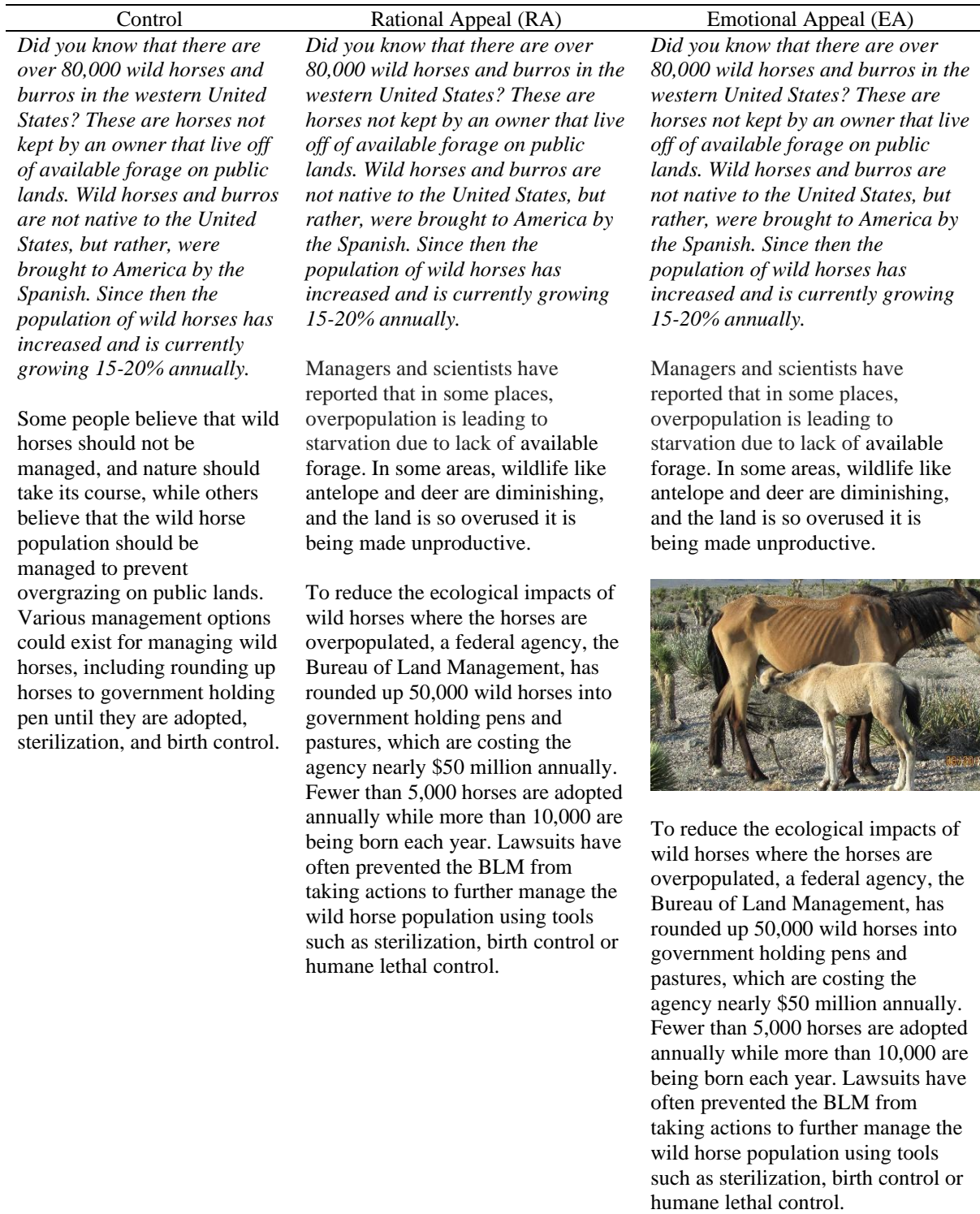
Table 1. Messages used in our experiment. Participants were randomly assigned to receive one of these three messages at the beginning of the survey.