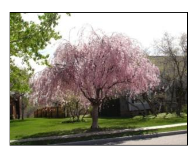
Double Pink Weeping Cherry