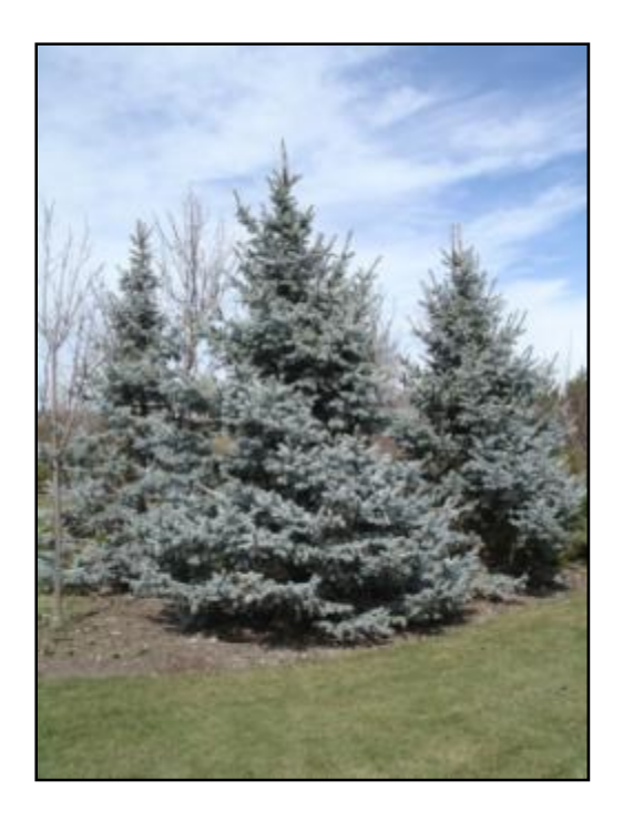
'Bakeri' Cultivar of Blue Spruce