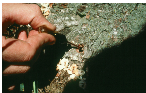
Old No-Pressure System for Treating Iron Chlorosis

Injection – Trunk injection usually is more involved than implantation. Liquid chemicals are injected into the stem through various types of holes and devices. A simple system that is no longer available was used for applying iron to treat iron chlorosis. Pre-measured ferric ammonium citrate dissolved in water was squeezed from small vials into 1/8" diameter holes drilled low on the trunk. This system was inexpensive and simple. Though the product no longer is sold, similar systems may be developed in the future.