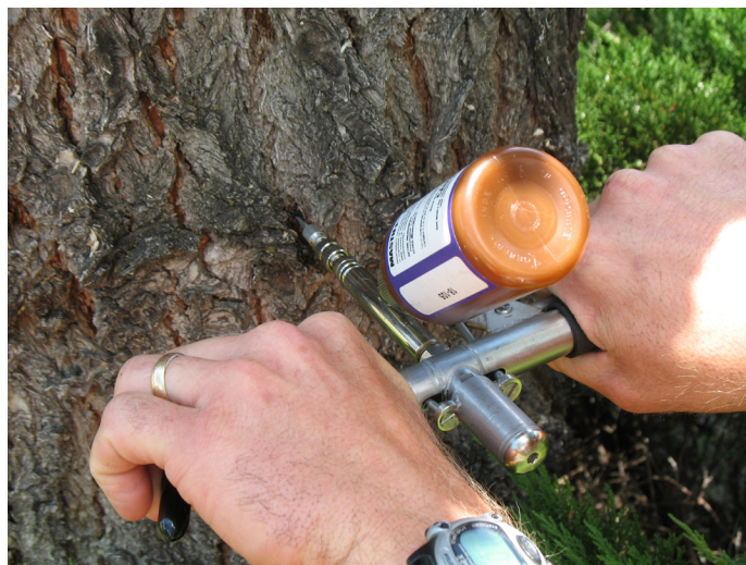
Injection System Without Drilled Holes

Pines and other resinous conifers produce resin when their living tissues are pierced and this resin will block chemical uptake from many injection systems. To overcome this Helson et al. (2001) devised a system called systemic tree injection tubes (STITs). The STITs consisted of 2 to 3 foot long pieces of 0.4 inch inside