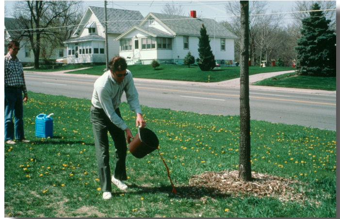
Soil Drench Method

Mulch or other surface organic matter is pulled back and the chemical is poured directly on mineral soil. Then the mulch is replaced. The amount of chemical used is based on inches of trunk diameter and will be stated on the label. Chemicals used would be similar to the soil injection method.