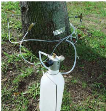
Pressurized Reservoir and Tubing System

ArborSystems' ( www.arborsystems.com ) Wedge injection system doesn't use drilled holes but relies on injection through a seal with a syringe and specially designed needle. It is fairly fast because of the pressure created by the syringe. Equipment and methods for this system are fairly complex and equipment cost is relatively high. No holes are drilled, but bubbles or embolisms can occur. ArborSystems' instructions encourage use of the system when bark is loose and flexible so a bubble is formed to contain the chemical after injection. Chemicals available include abamectin, imidacloprid, phosphorous acid, propiconazole, and plant growth regulators.