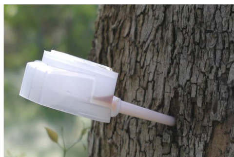
Pressurized Capsule Injection System

by depressing a plunger that locks in place. The capsule then is pressed onto a tube that is already inserted into the tree, breaking a seal in the capsule and releasing the pressurized chemical. Chemicals available through Mauget include antibiotics, abamectin, azadirachtin, bidrin, imidacloprid, metasystox-R, debacarb, phosphorous acid, tebuconazole. Material cost to treat a