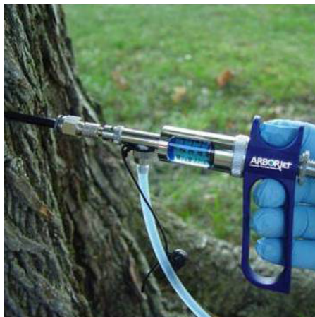
Drilled Hole Injector

Utah, but Mauget and similar capsules seem to be lower pressure). These include Arborjet's Tree I.V. system that uses tees and tubing and delivers high volumes of chemicals from a pressurized reservoir, and their Quik-Jet system that applies small chemical volumes with a syringe ( www.arborjet.com ).