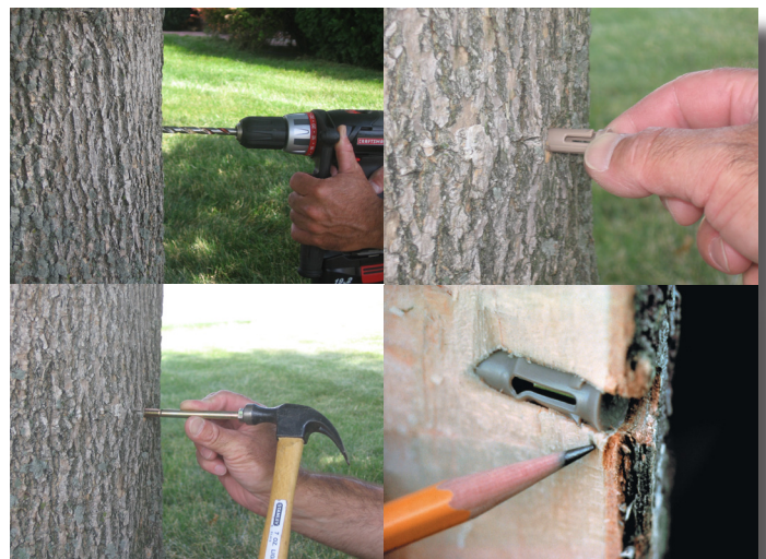
Implant Installation (Medicap)

Implantation – The main form of implant available for tree use is a gelatin coated capsule that contains the chemical to be used. The capsule is contained in a plastic structure to protect it as it is inserted into the tree. The implant is inserted into a 1/4" to 3/8" diameter hole drilled in the trunk into the outer xylem or sapwood, just inside the cambium. Water from the transpiration stream seeps into holes in the plastic container, dissolves the gelatin, and the target chemical is taken up in the