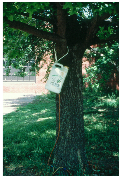
No Pressure System Using Container and Tubing for Iron Chlorosis Treatment

Higher pressure systems are available that inject chemicals using either a syringe or tubing, tees, and a chemical reservoir designed to be under pressure (pressures in these systems have not been tested in