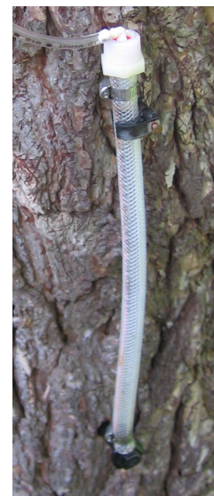
Modified STIT Tube

That STIT study also used ArborSystems' Wedge injector for conifers and found it to be ineffective because of chemical leakage from bark crevices. ArborSystems, however, has a different tip they use for injecting