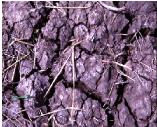
Photo 2. Salt crystals on the soil surface. This soil has an EC_e of 4.4 dS/m.

Only plants with moderate salinity tolerance grow well in soils with an EC_e near 4 dS/m. See the related Utah State University Extension Bulletins "Salinity and Plant Tolerance" and "Selection and Planting of Landscape Trees" for more information about salinity tolerance.