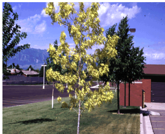
Photo 3. The effect of high soil pH on iron deficiency in maple.

Most plants do well at the range of pH's listed as acceptable; however, some acid-loving plants will not grow well at pH's above 7.0. Examples of these include blueberries, raspberries and azaleas. Other sensitive plants are susceptible to iron deficiency at soil pH's of 7.8 or above (photo 3). See the related Utah State University Extension Electronic Publication "Control of Iron Chlorosis in Ornamental and Crop Plants" and "Selection and Planting of Landscape Trees" for more information about pH tolerance and controlling iron chlorosis. It is extremely difficult to change soil pH. Select soil with the appropriate pH for the desired vegetation. Most soils in Utah have pH's in the mid-7.0 to low 8.0 range.