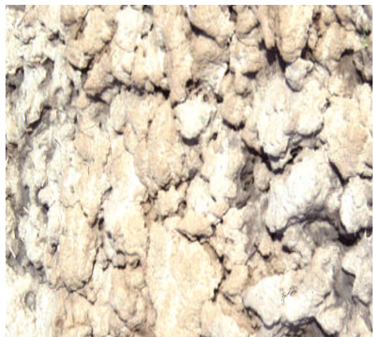
Photo 4. The effect of organic matter on soils with similar textures (silty clay). The soil on the left has no organic matter and, consequently, no structure. The soil on the right contains 5% organic matter and is well aggregated.