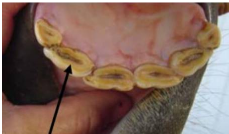
Figure 6b. Cups seen in a young horse of 6 years of age as all cups are present.

The shape of the grinding surface, amount of tooth seen below the gum line, and angle of the teeth change with age. A horse under 9 years of age will have a rectangular grinding surface, a horse from 9 years to mid-teens will have a more rounded grinding surface, while a horse in its later teens or older will have a triangular surface (Figures 7a and b).