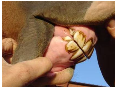
Figure 8a. Young horse with a more vertical profile and less length of tooth visible.

The younger horse will show a shorter tooth visible below the gum line, while a term used for the older horse is “long in the tooth” due to more visible tooth. When viewed from the side with lips parted, the young horse will exhibit a more vertical alignment to the incisors, while an older horse will have more of an angle with a more protruded appearance (Figures 8a and 8b).