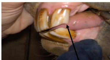
Figure 10. This mare has hook at 11 years old due to a lack of opposing surface at the back edge of the top molar.

Another subtle indicator on the same corner tooth is the 7- and 11-year hook. As the mouth changes shape the rear of the top and bottom corner incisors may not meet, allowing for a hook to form on the top incisor (Figure 10). The first time this hook appears is during the 7-year-old