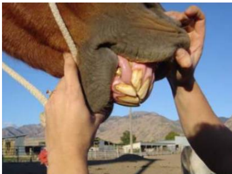
Figure 8b. Older horse with a more angled profile and more length of tooth visible.