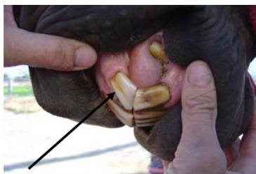
Figure 9. Galvayne's groove. Galvayne's Groove

A more subtle indicator that can assist with aging the horse over 10 years of age is the Galvayne's Groove (Figure 9). This is a groove that appears near the gum line of the corner incisor. It begins at the center of the outer surface of the tooth in a 10-year-old. At 15 years the groove extends halfway down the tooth; at 20 years it extends the entire length of tooth; at 25 years the upper half of the groove is gone so a groove appears only in the bottom half; and at 30 years the groove is completely gone.