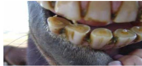
Figure 7b. Old horse's mouth with dental stars and triangular table.

The younger horse will show a shorter tooth visible below the gum line, while a term used for the older horse is “long in the tooth” due to more visible tooth. When viewed from the side with lips parted, the young horse will exhibit a more vertical alignment to the incisors, while an older horse will have more of an angle with a more protruded appearance (Figures 8a and 8b).