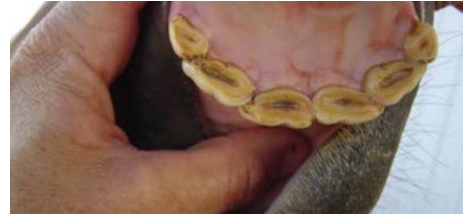
Figure 7a. Young horse's mouth with cups and rectangular table or grinding surface.

The shape of the grinding surface, amount of tooth seen below the gum line, and angle of the teeth change with age. A horse under 9 years of age will have a rectangular grinding surface, a horse from 9 years to mid-teens will have a more rounded grinding surface, while a horse in its later teens or older will have a triangular surface (Figures 7a and b).