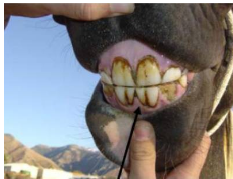
Figure 5. A horse at 3 ½ years of age. Centrals are permanent, and intermediates are ready to fall out.