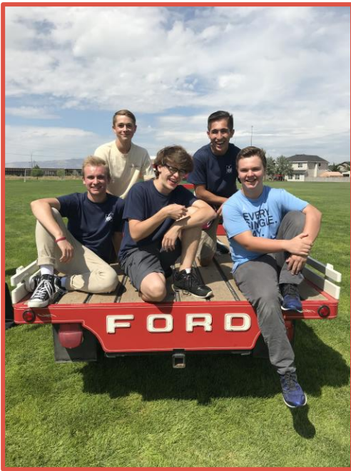
Top: Culinary students from Merit College Prep celebrating a successful farm to school day, 2019.