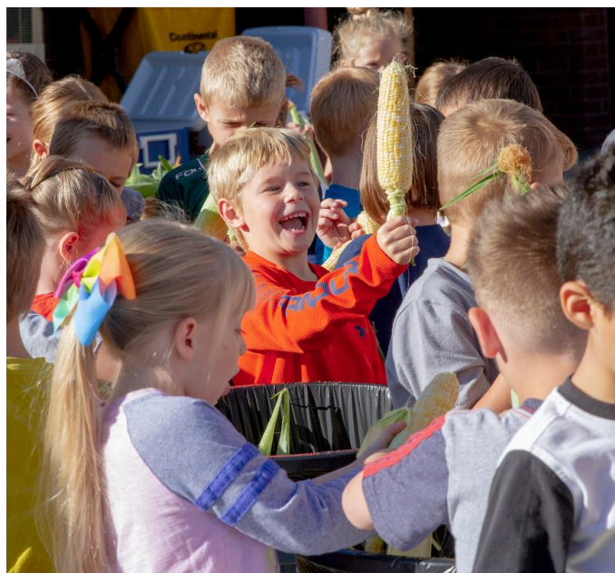
Corn husking competition in Box Elder School District, 2019

The Farm to School Commission will help transform individual activities into a cohesive movement that strengthens our local food economy.