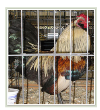
Figure 1. Examples of a well-bedded cage and a well-groomed Black Rosecomb hen and Old English cock.