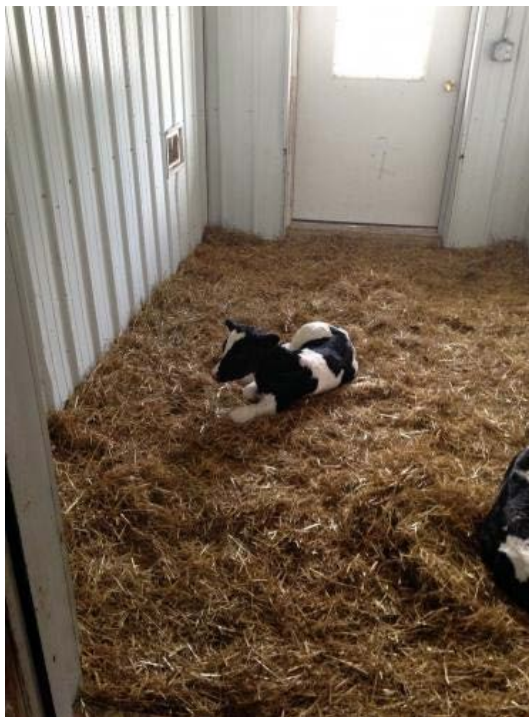
A group housing warming room with straw bedding. (Figures from MSU Extension, 11/12/15, F. Cullens)

I was intrigued by the group housing warming room, wondering about how long calves might stay in there and about transmission of infectious diseases between calves. This was addressed in the article also: