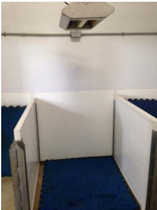
A warming room with individual stalls, easy to clean rubber mats and a radiant heater on a timer.

The article goes on to emphasize the importance of ventilation, as mentioned above, and ease of cleaning, including the value of floor drains . One good point: “Two rooms may be necessary so that one location can be totally cleaned out and dried while the other is in use. Without proper management and sanitation, warming rooms and boxes will quickly become a contaminated environment and present a significant disease risk to calves.”